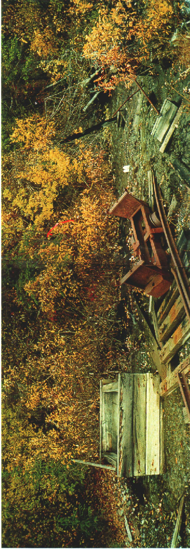
Photo 77-1: Mine water from portal (right) draining down culvert opening (left).