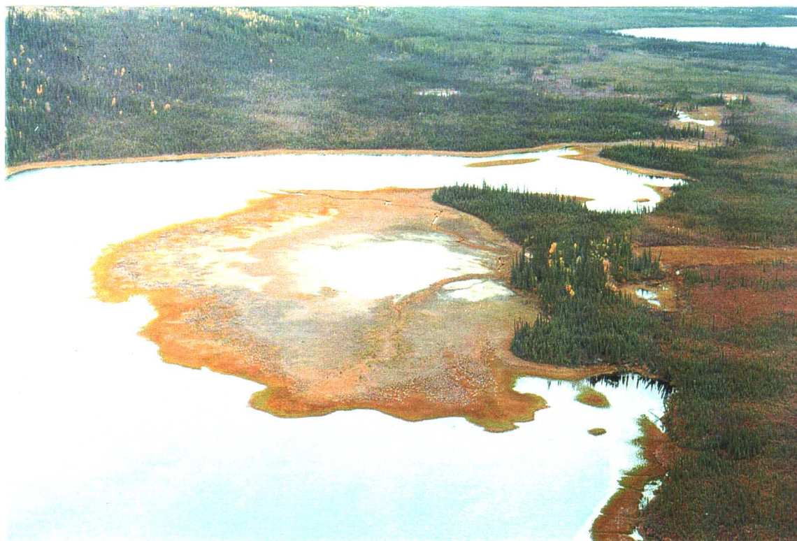
Photo 80-2. Aerial view of tailings, looking eastward. Note that much of the tailings fan is submerged or has naturally revegetated.