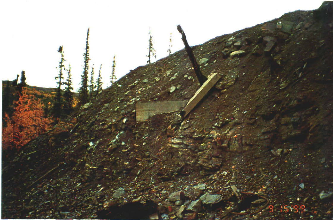
Photo 81-13: Concrete foundation protruding from north slope of upper millsite area.