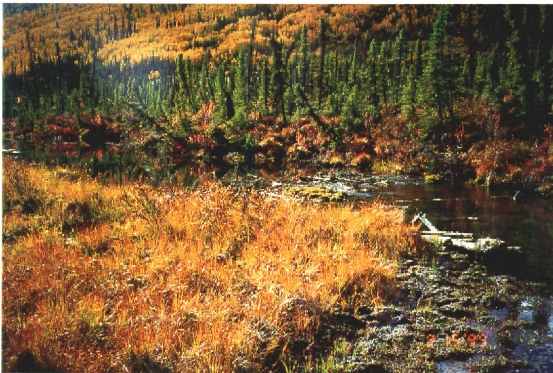
Photo 81-4: Upstream from small tailings to near mouth of Christal Creek.