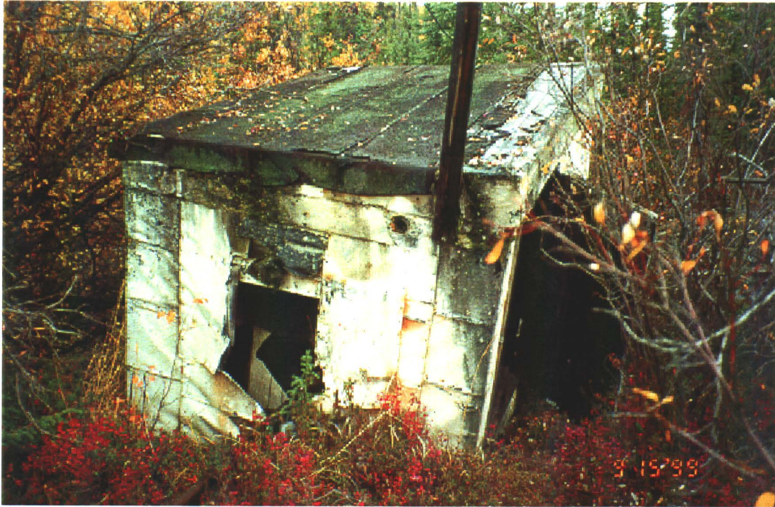
Photo 81-9: Tailings pumphouse in forested area north of millsite.