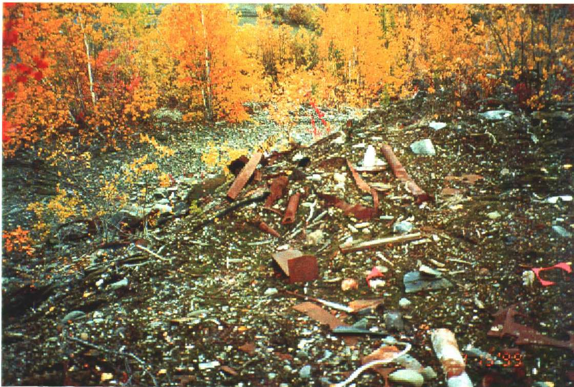
Photo 81-12: Metal and wood debris at west end of upper millsite area.