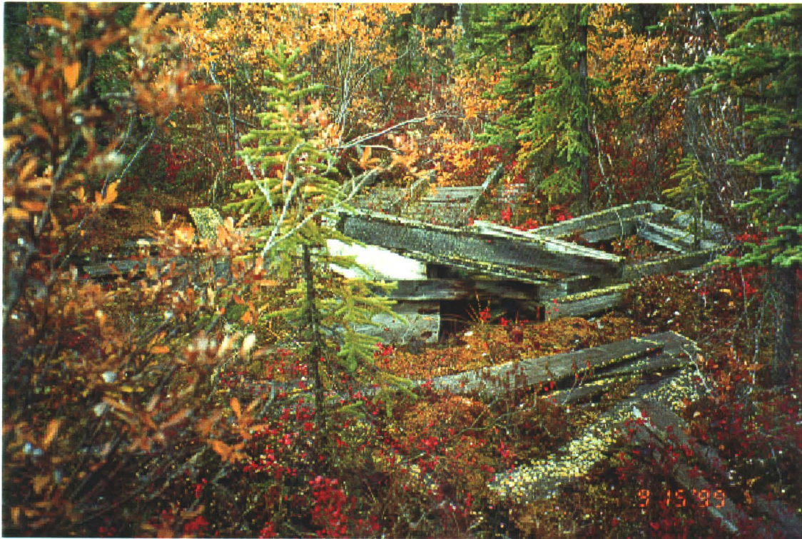
Photo 81-11: Wood debris remaining from former shack south west of millsite.