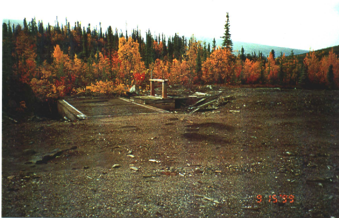
Photo 81-10: Concrete foundation of weigh scale at south end of millsite.