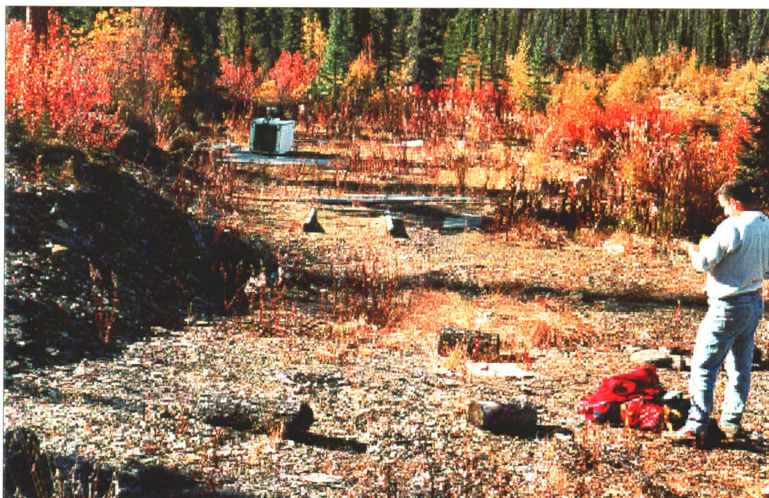
Photo 86-2 : Meilecke Site. Camp site located in old trench (looking west).