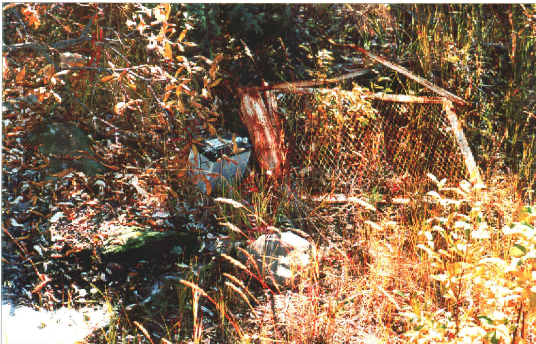
Photo 86-6 : Meilecke Site, battery near stream (100m S.W. of camp site).