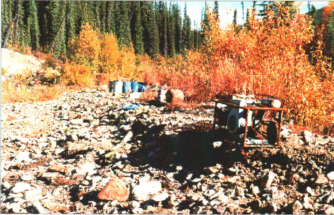
Photo 86-5 : Meilecke Site, generator & debris along creek looking east.