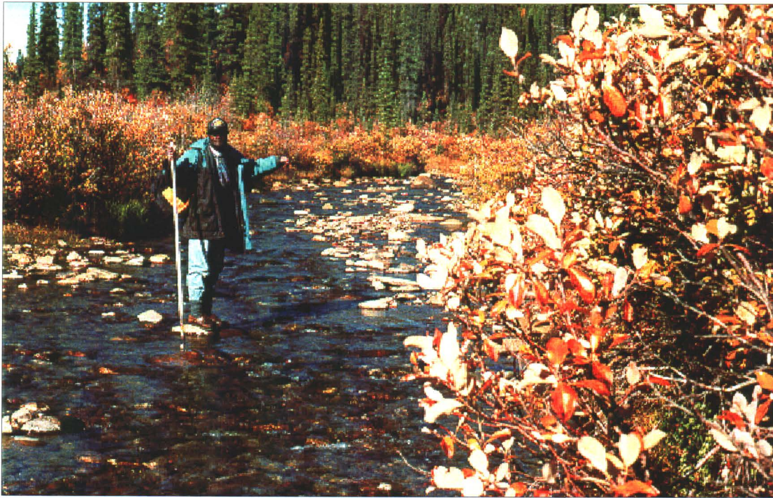
Photo 86-7 : Meilecke Site. Downstream water sample location 50m E. of confluence of Haggart & Iron Rust Creeks.