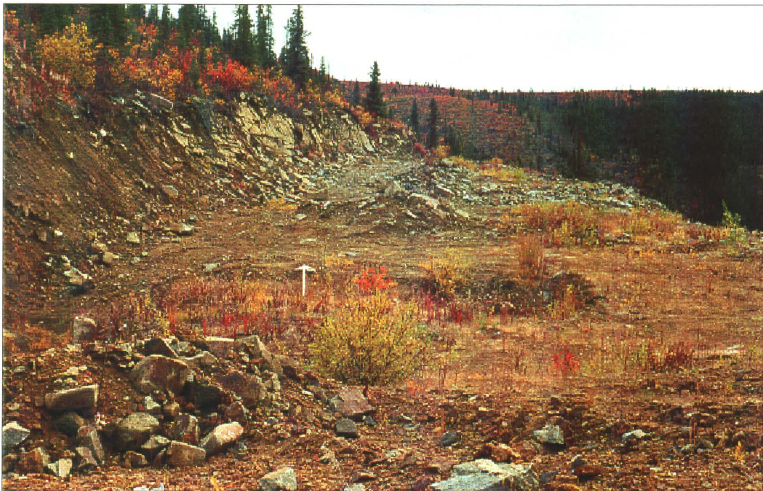
Photo 89-1 : Olive. Further along trench line from access road (looking S. E.).