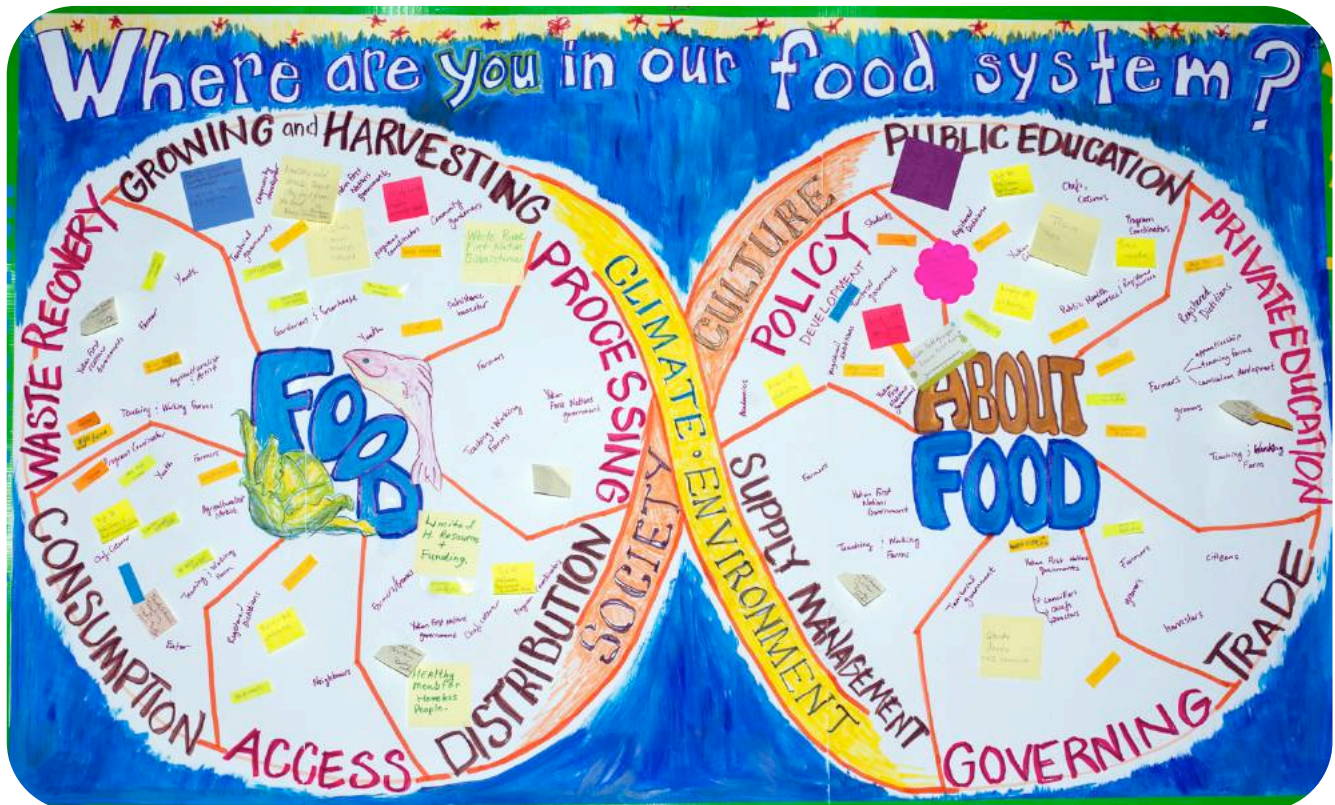
(Above): Delegates at the Roundtable and Open House had the chance to situate themselves and/or their organizations within the Yukon food system, thereby creating a sense of collective ownership over the system and the process of advancing Yukon food security.

Overall, there is a lot of PASSION and MOMENTUM for securing our food system for the future. No one agency, government or individual is going to solve the issue of food insecurity. There is not one solution, but a range of holistic approaches is needed (10).