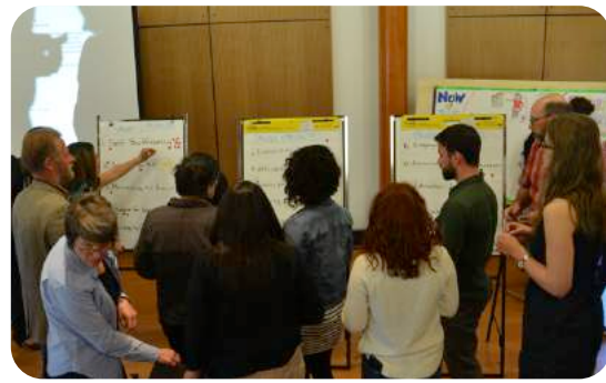
(Pictured left): Roundtable participants amidst breakout discussions; (right): Delegates vote on priorities for food security in the Territory.