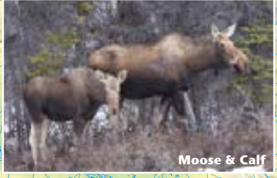
Moose & Calf