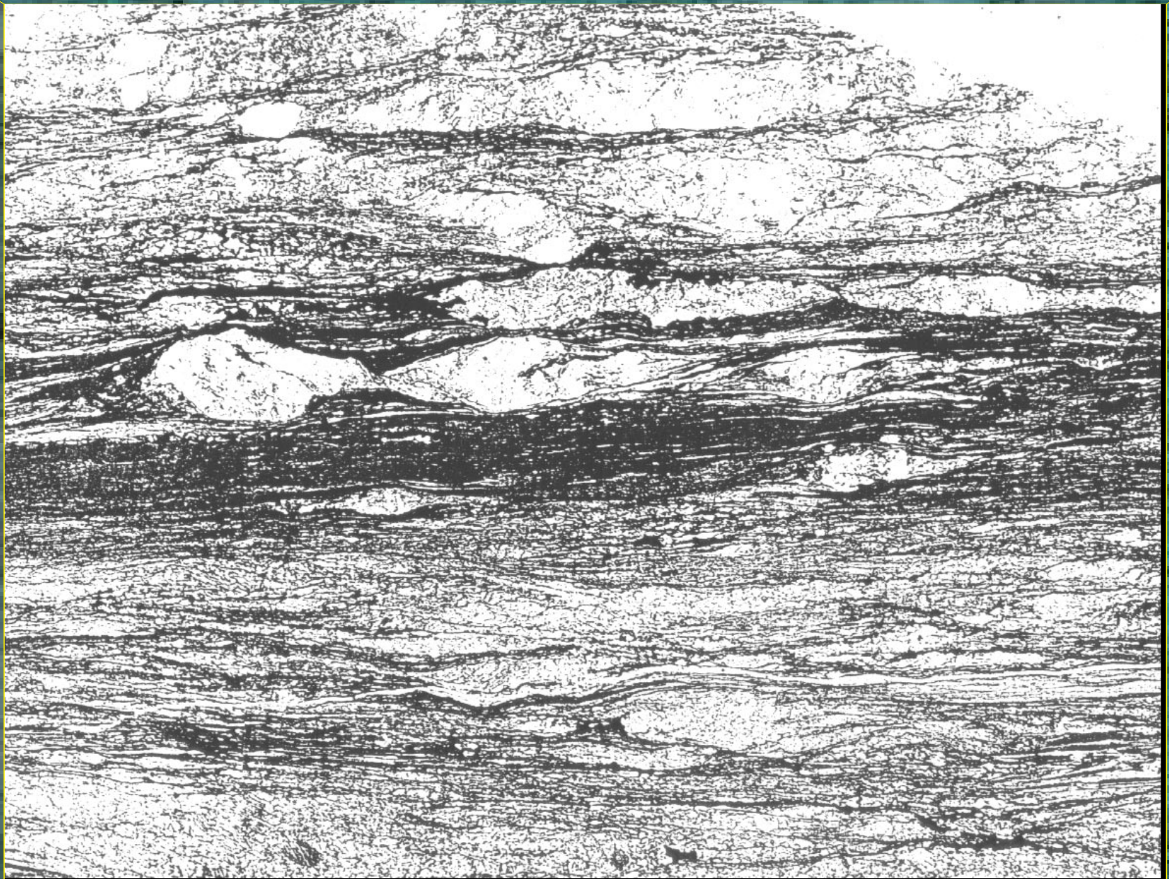
Figure 27: Asymmetric fault zone fabrics in the lower plate of the Cayoosh Creek Fault indicate an upper plate- to- the- northwest sense of shear. Common shear sense indicators of this fault zone include shear bands, asymmetric porphyroclasts, pressure shadows and s- c fabrics. This section from mylonitic fault zone rocks at Stop 2- 2