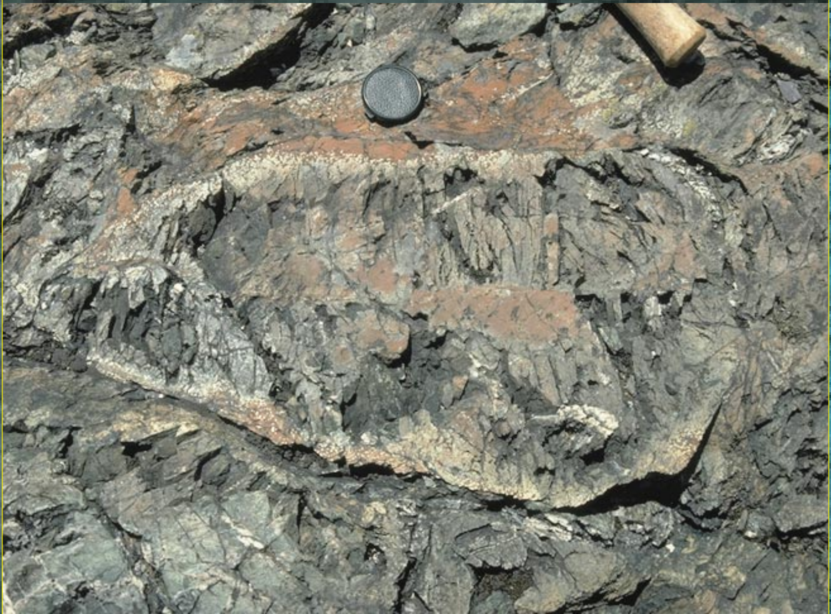
Figure 29: Pillowed greenstone of the Bridge River Complex exposed on the ridge near headwaters of Downton Creek.