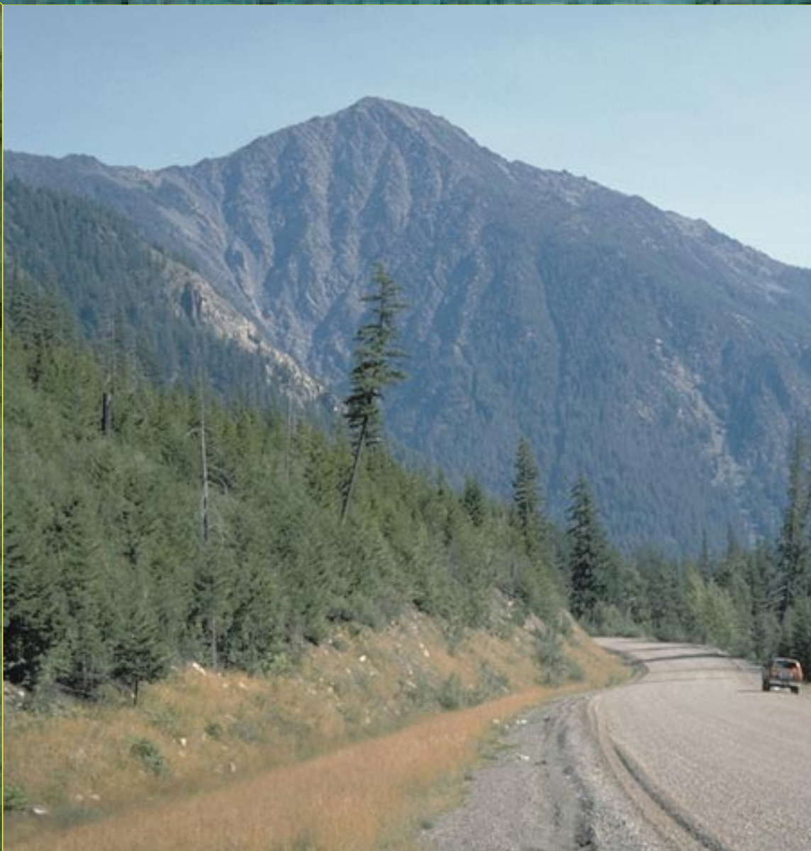
Figure 33: View northeast toward Bridge River/Cayoosh contact, east of Duffey Lake road. Transitional facies of interlayered greenschist, siltstone and chert along the contact (dotted line) between the Bridge River Complex (massive cliffs to the right) is conformably overlain by Cayoosh Assemblage (recessive saddle to the left). The section is structurally inverted on the over-turned limb of a regional southwest-verging syncline.