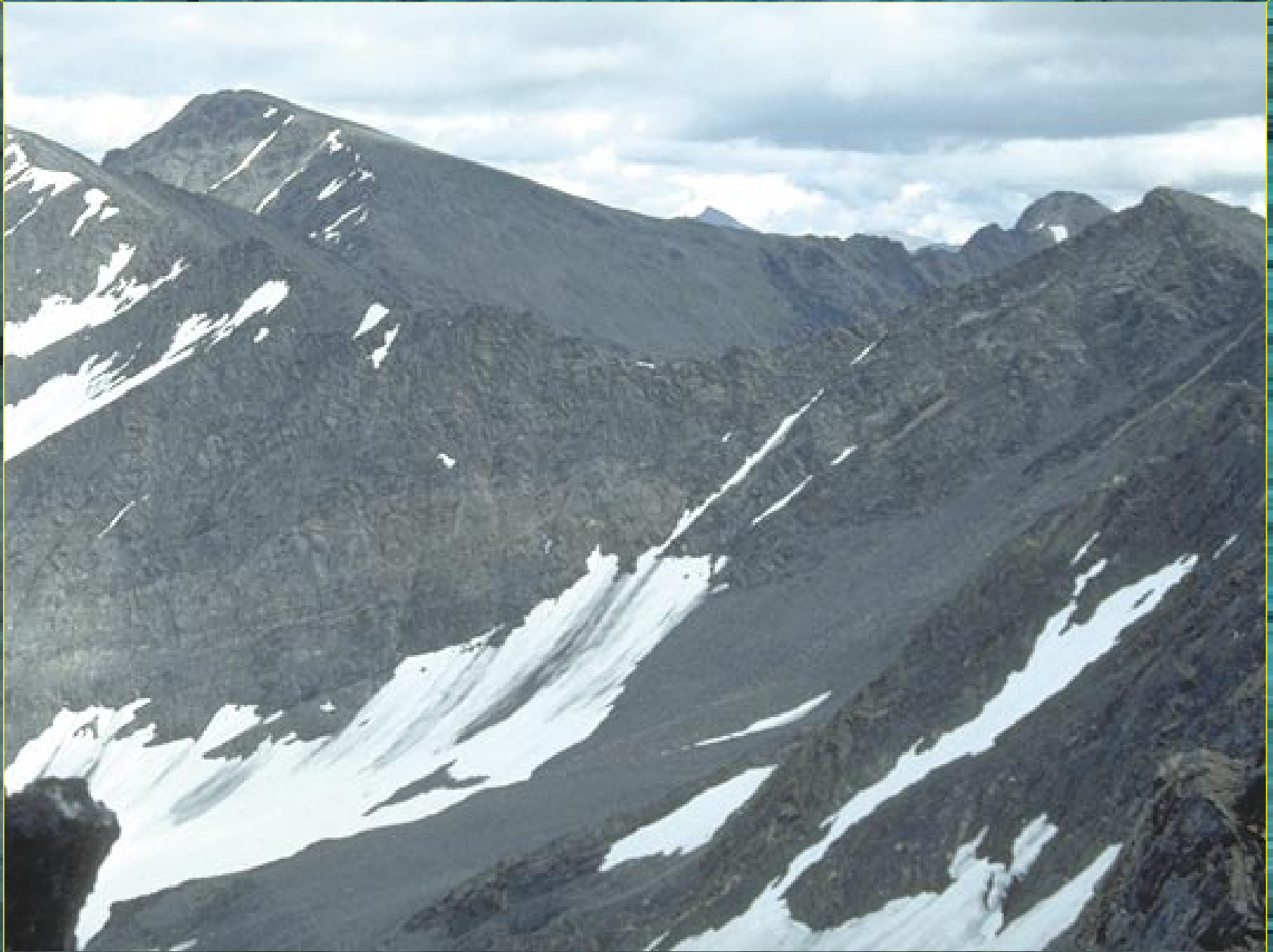
Figure 34: Ridge section of volcanic sandstone, siltstone and shale of the Cayoosh Assemblage, exposed in headwater region of Melvin Creek.