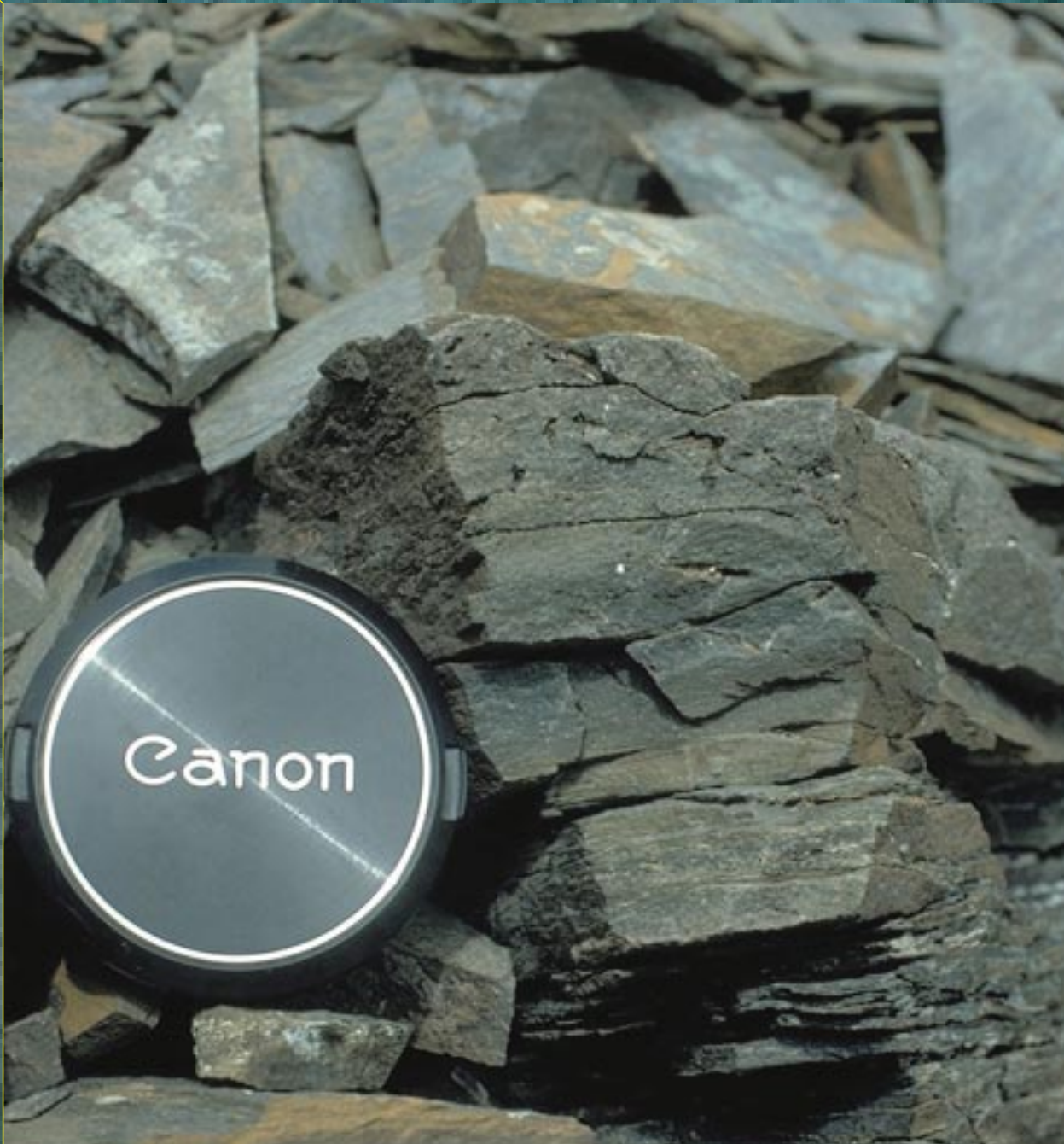
Figure 36: Thinly laminated turbiditic siltstones of the lower Cayoosh assemblage.