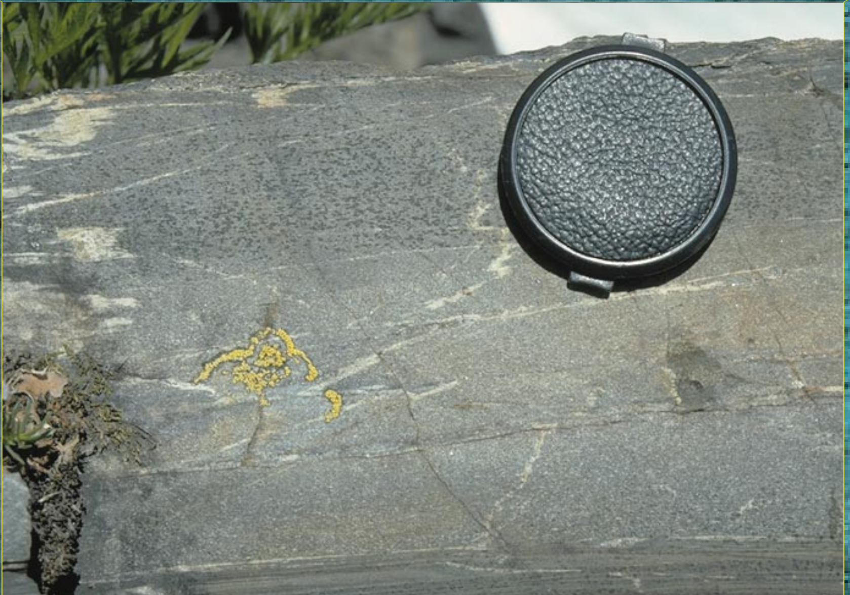
Figure 37: Graded volcaniclastic sandstone and siltstone of the Cayoosh assemblage exposed along ridge crest north of Duffey Lake.