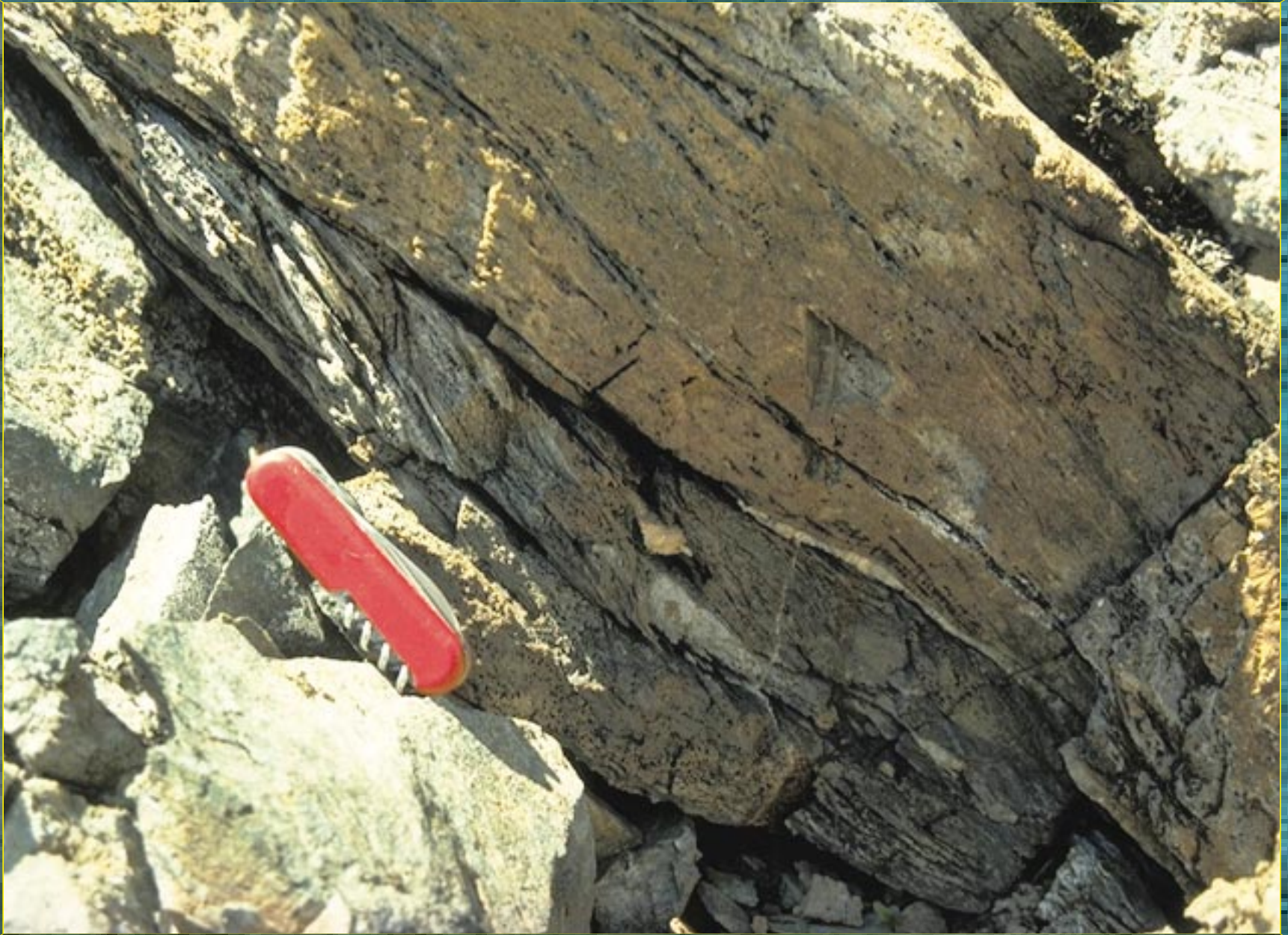
Figure 40: Asymmetric fault zone fabrics along the roof thrust of the Twin Lakes fault zone. Hanging wall rocks are sheared talc-carbonate “listwanite” schists of the Bralorne- East Liza Complex. Near Twin Lakes at headwaters of Melvin Creek.