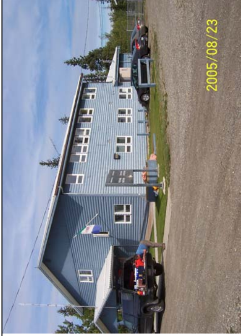
Photo 393: 5987 Pelly Crossing nursing station. (looking northeast)