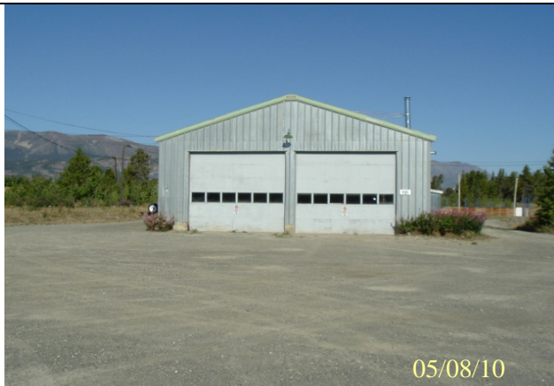
Photo 029: 1131 Carcross search and rescue building (former grader station).