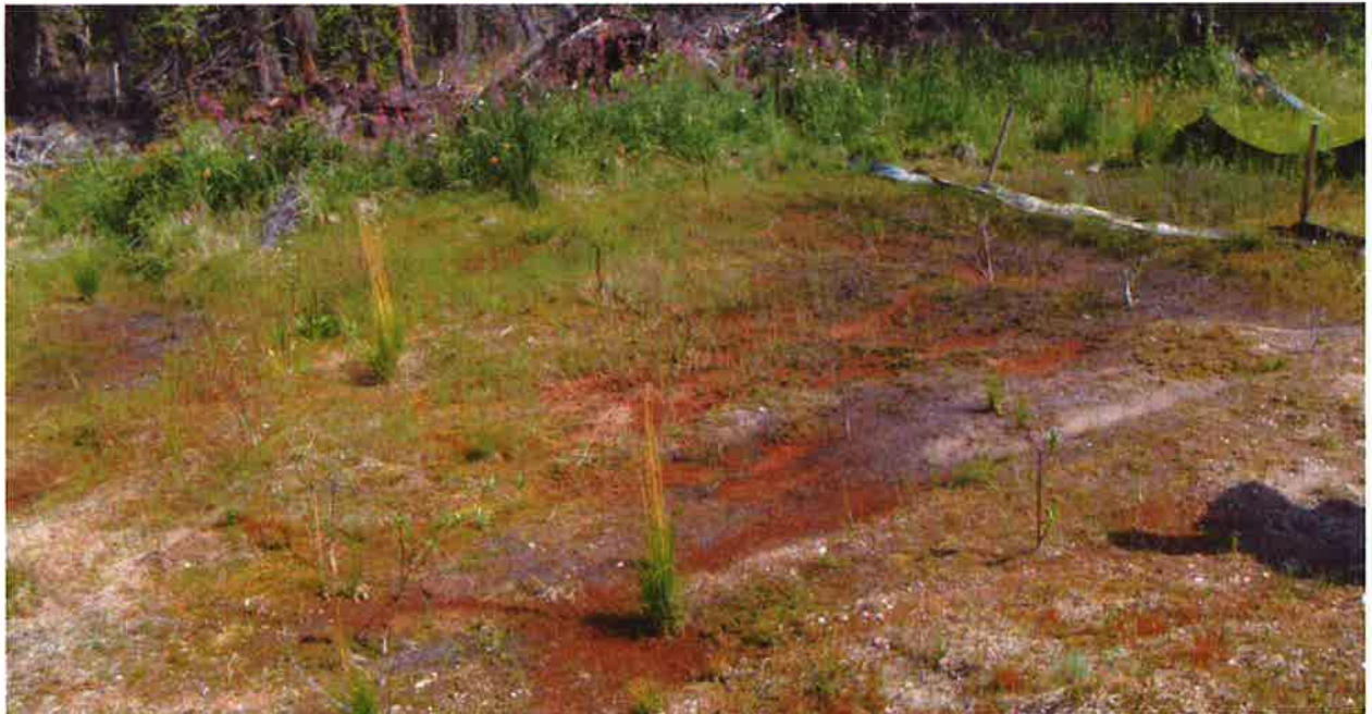
Photographs 6 - 7: Silt fences located between the area of the proposed Heap Leach Facility Sediment Pond and Williams Creek and re-vegetated area. Re-establishment of grass vegetation in this area appears to be hampered by the periodic pooling of water. Willow cuttings planted in 2011 had taken hold with limited new growth visible in 2013.