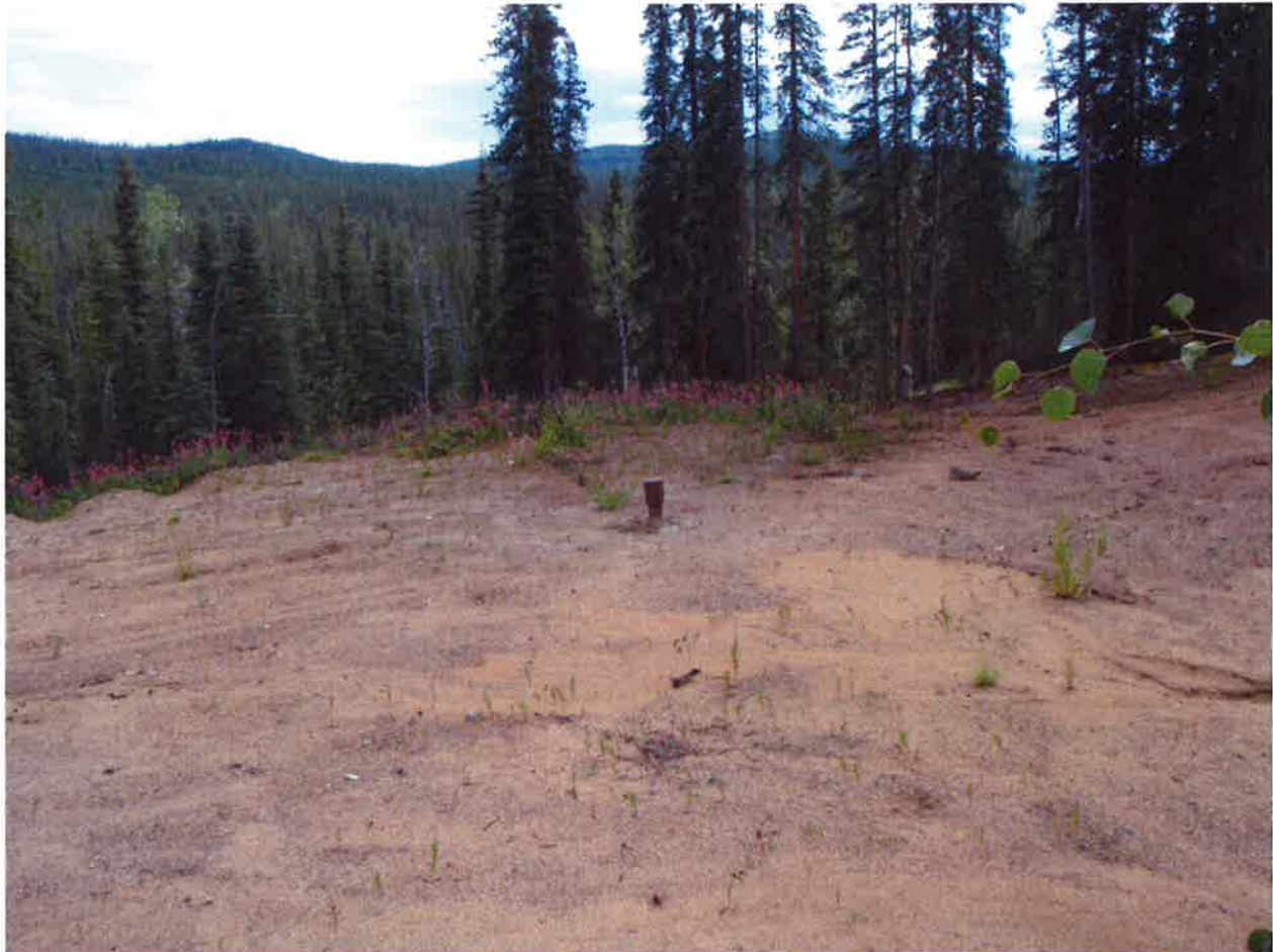
Photograph 17: Water supply well and pad near proposed camp site.