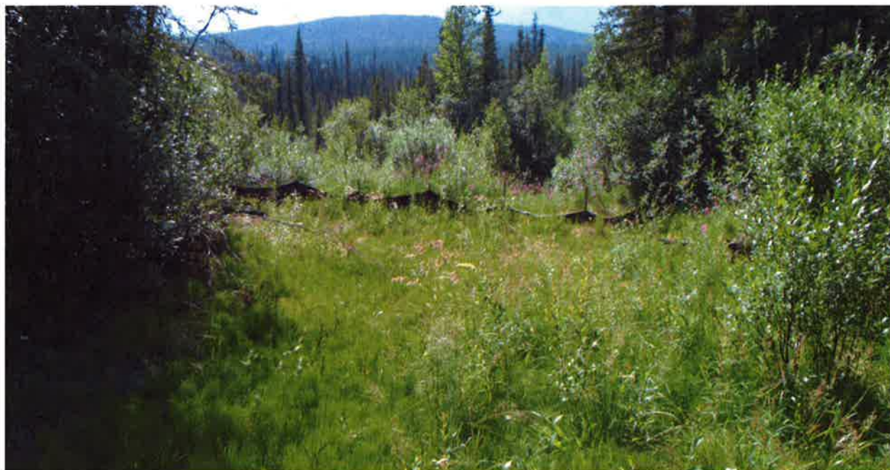
Photograph 10: Re-vegetation on drill access road in the Events Pond area.