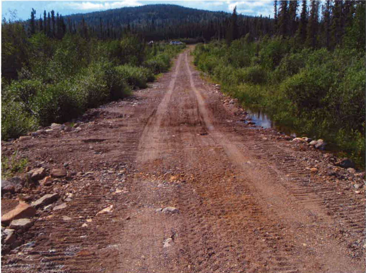
Photograph 23: View of access road repair just south of Williams Creek, looking south.