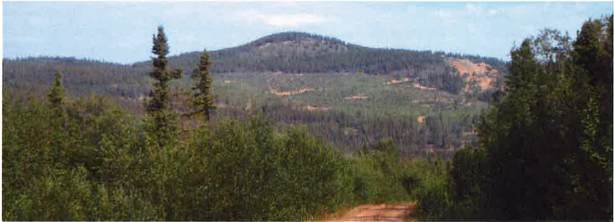
Photograph 8: View of proposed Heap Leach Facility and open pit areas (far slope) from site access road, looking north.