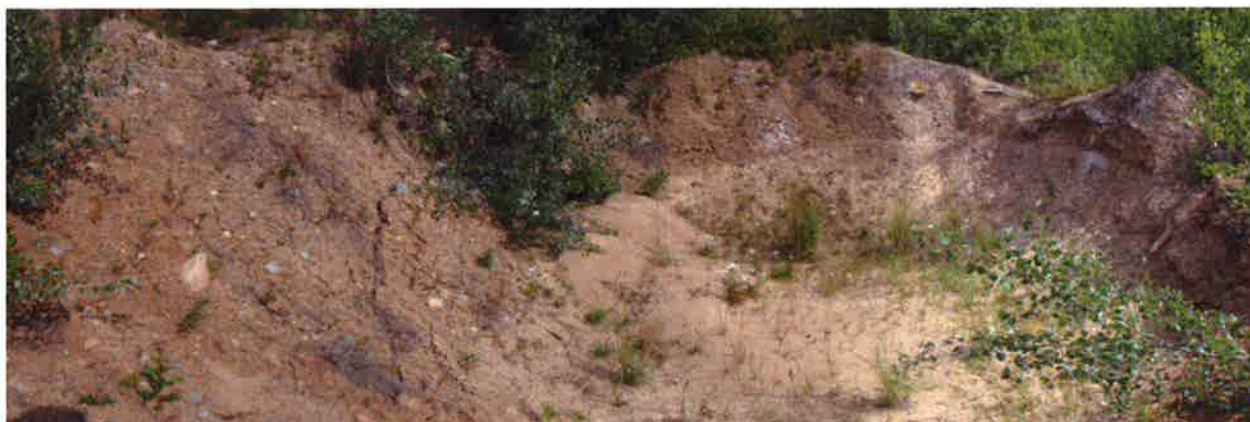
Photograph 14: Drill pad sediment basin trap near the proposed Events Pond.