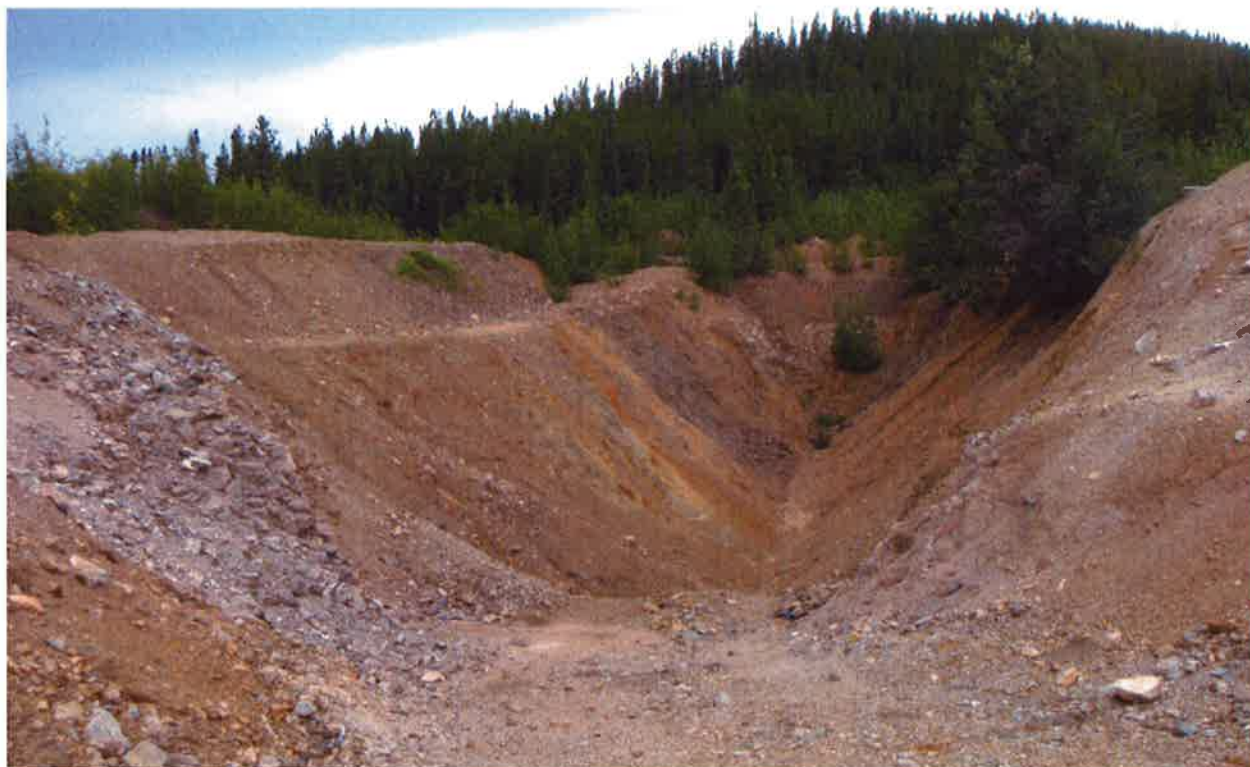
Photograph 16: Bulk sample excavation site.