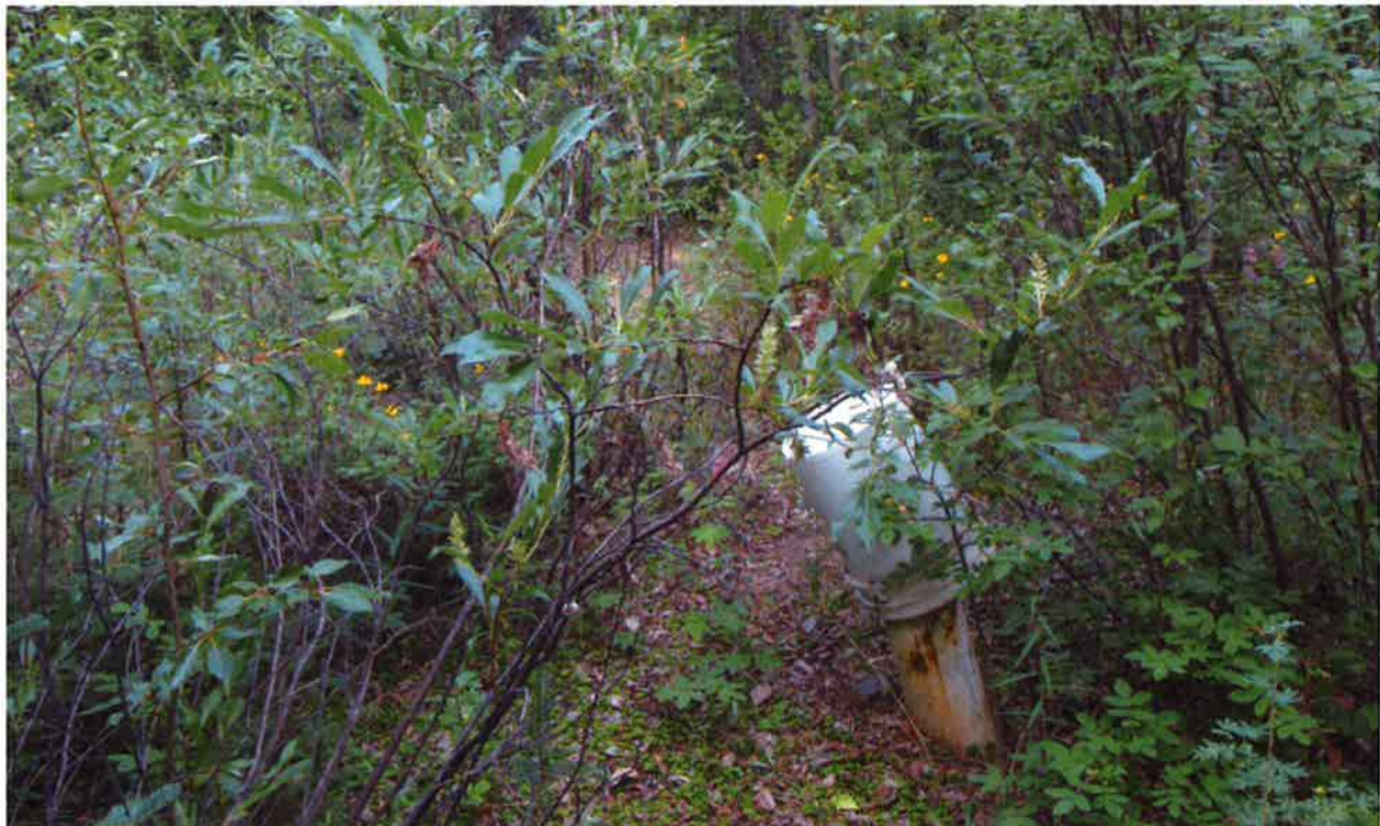
Photograph 13: Re-vegetation at DH95-H drill pad in the Heap Leach Facility area.