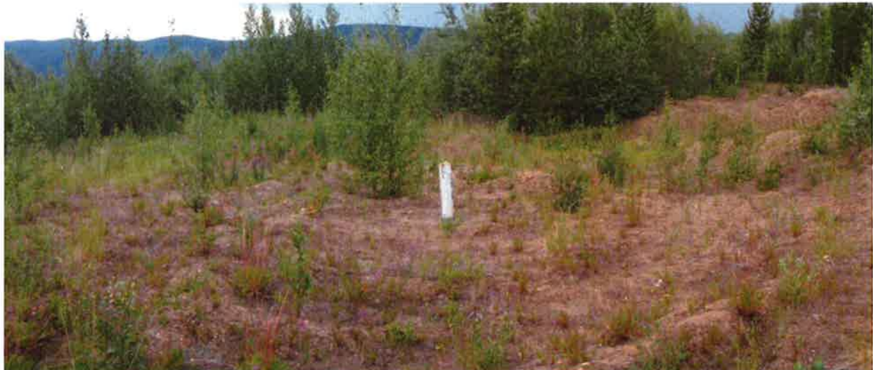
Photograph 12: Re-vegetation on BH-26-07 drill pad in the Heap Leach Facility area.