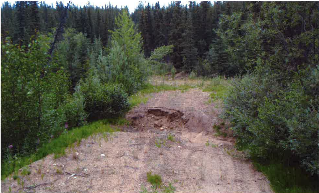
Photograph 20: Erosion on road near North Williams Creek crossing.