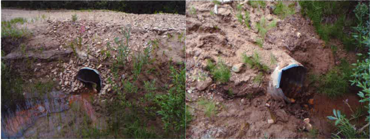
Photographs 18 and 19: Inlet (left) and outlet (right) of culvert on main access road crossing of North Williams Creek located north of the Waste Rock Storage Area.