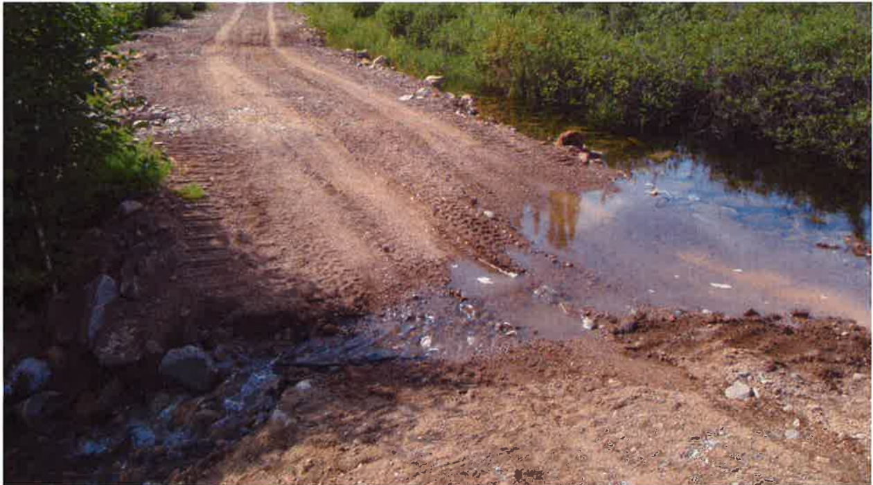
Photographs 21 - 22: View of access road crossing of Williams Creek looking north (top) and south (bottom).