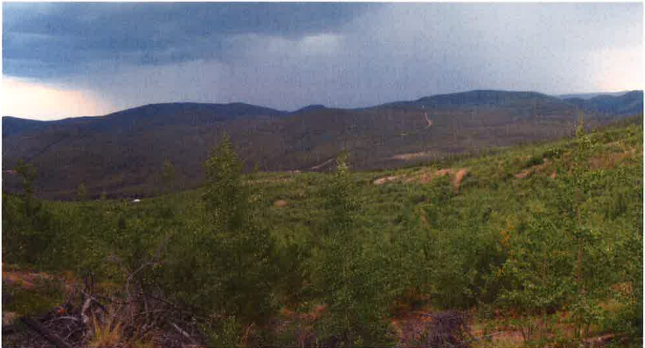
Photograph 9: View of proposed Heap Leach Facility (foreground) looking south west.