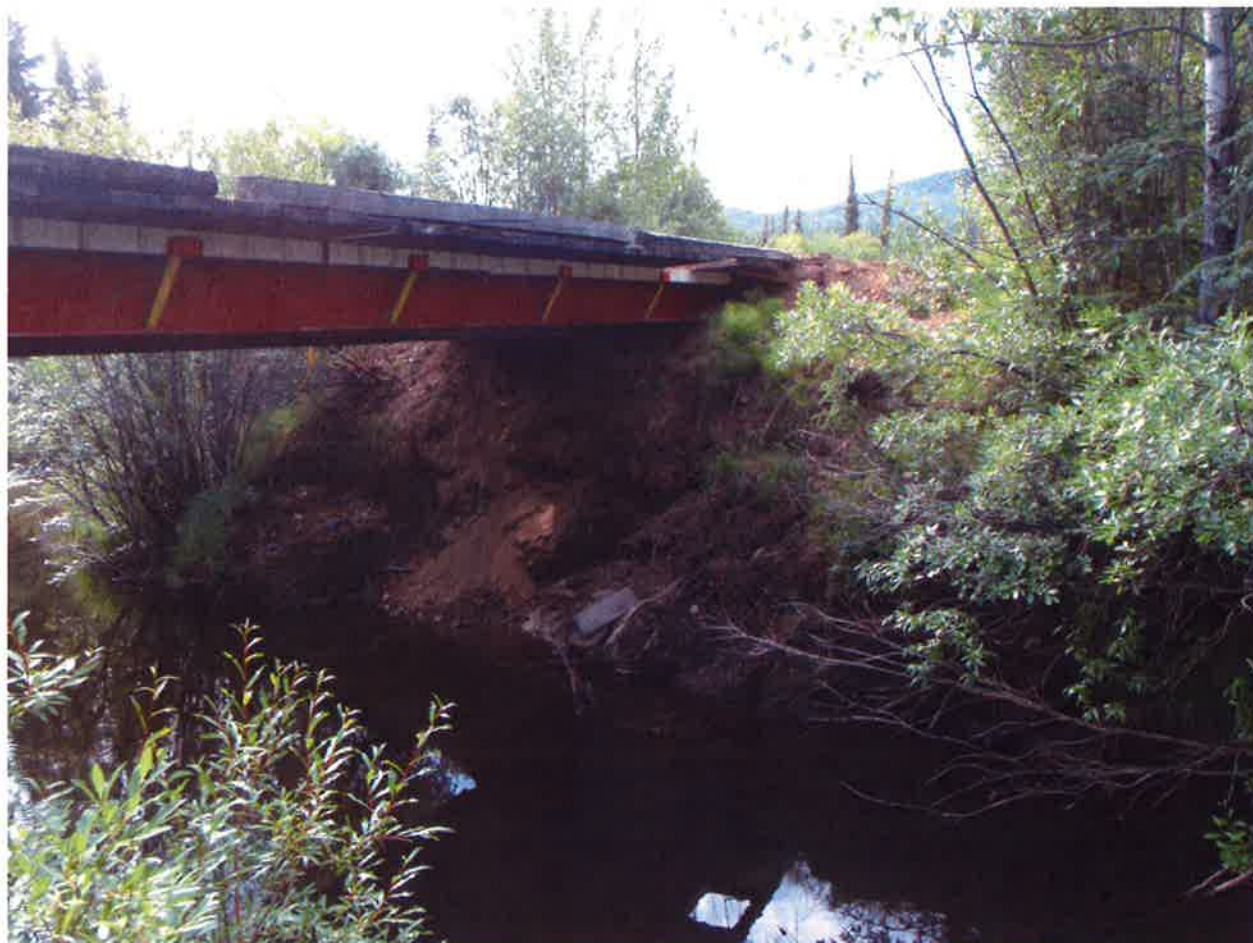
Photograph 24: Site access road crossing of Merrice Creek, view of bridge abutment nearest to the Village of Carmacks. Date Taken: July 16, 2013

o:\final\2013\1427\13-1427-0077\1314270077-222-l-rev0-1000\attachment 1\attachment 1 - photographs july 16 2013.docx