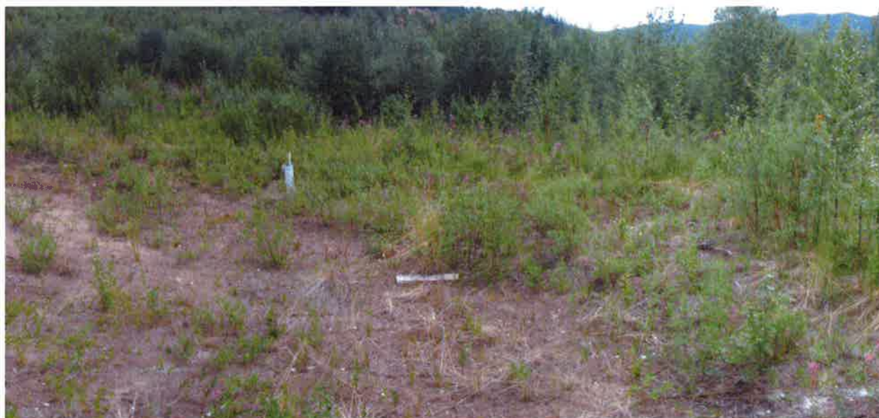
Photograph 11: Re-vegetation at BH17-07 drill pad in the Heap Leach Facility area.