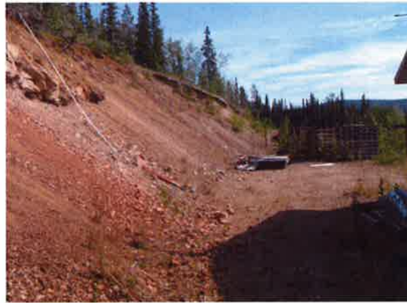
Photographs 1 - 5: Carmacks exploration camp – views looking east to camp (top), looking west to camp (middle), slope immediately north of camp looking west (bottom left) and east (bottom right)