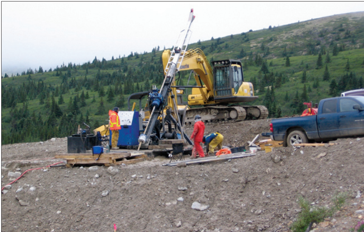
Silver Hart — CMC Silver

YG and First Nations should work to maximize the participation of local business and industry in mining exploration and development activities.