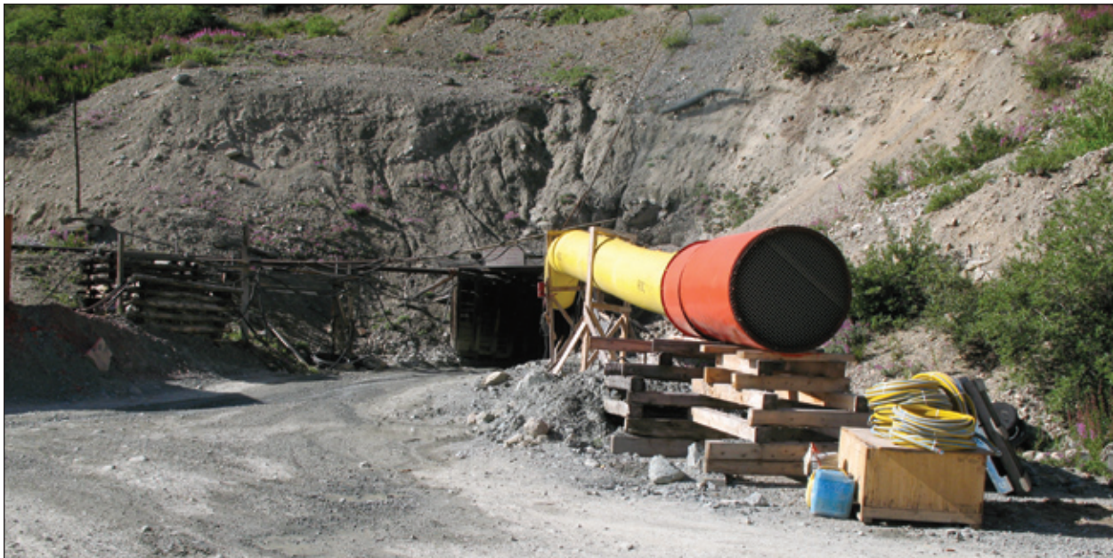
Freegold Mountain — Northern Freegold