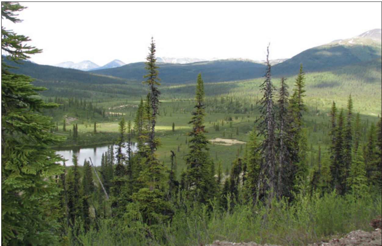
Andrew —Overland Resources

As noted in the 2008 YMAB Annual Report, land use planning should work to define principles and processes to share natural resources within a region in a sustainable manner. The purpose of such plans should be to mitigate potential land use conflicts, rather than prescribing zoning and land alienation. Considerations should include protection of the natural environment (including flora, fish and wildlife), the wellbeing of First Nations and other Yukon residents, and sustainable economic development. The actual assessment of specific projects or activities should be conducted through established regulatory and governmental processes including, but not limited to, those defined in the Yukon Environmental and Socio-economic Assessment Act (YESAA).