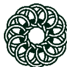
Table ronde nationale sur l'environnement et l'économie Édifice Canada, 344, rue Slater, bureau 200 Ottawa (Ontario) Canada K1R 7Y3

National Round Table on the Environment and the Economy Canada Building, 344 Slater Street, Suite 200 Ottawa, Ontario Canada K1R 7Y3