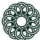
Table ronde nationale sur l'environnement et l'économie Édifice Canada, 344, rue Slater, bureau 200 Ottawa (Ontario) Canada K1R 7Y3

National Round Table on the Environment and the Economy Canada Building, 344 Slater Street, Suite 200 Ottawa, Ontario Canada K1R 7Y3