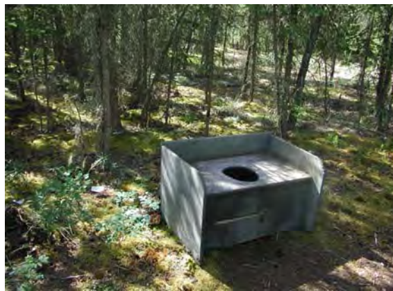
Makeshift latrine at informal campsite on Thirty Mile, 2002 To be replaced with sealed privy.

It is recommended that the 1990 management plan be reviewed with the Ta'an Kwach'an Council and affected departments, prior to any new work taking place based on the Implementation Priorities. In the context of the Ta'an Kwach'an land claim settlement, there may be different priorities and issues that require attention, particularly related to First Nation heritage values along the river. Final Agreement obligations through Chapter 13 (Heritage) may provide direction on implementation priorities over the next 10 years and need to be discussed in the context of heritage river management.