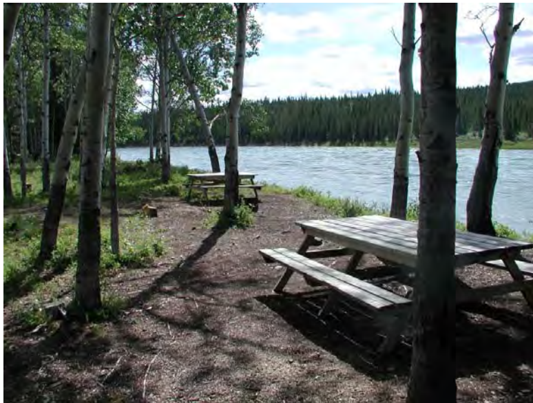
Designated campsite along Thirty Mile, Summer 2002