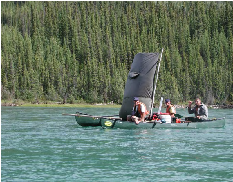
Recreational paddlers, Thirty Mile Section of Yukon River, 2002