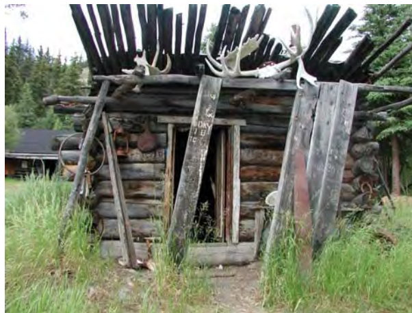
Old cabin at Hootalinqua, Summer 2002

The 1998 Fox Lake Forest Fire did not directly impact management of the river. However, given the extent and location of the fire, it is expected that natural values associated with the biotic environment have been affected.