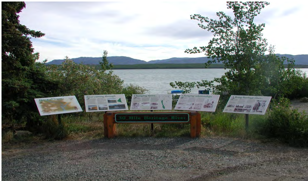
Thirty Mile Interpretive Panels at Lake Laberge Campground, Installed 1993