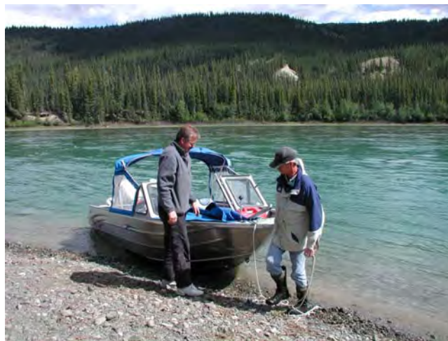
Recreational boating on Thirty Mile, Summer 2002

The Yukon is in a privileged position with regards to the condition of values associated with the Thirty Mile Section of the Yukon River. There have been no significant negative changes to any values for which the river was nominated (refer to summary in Appendix A).