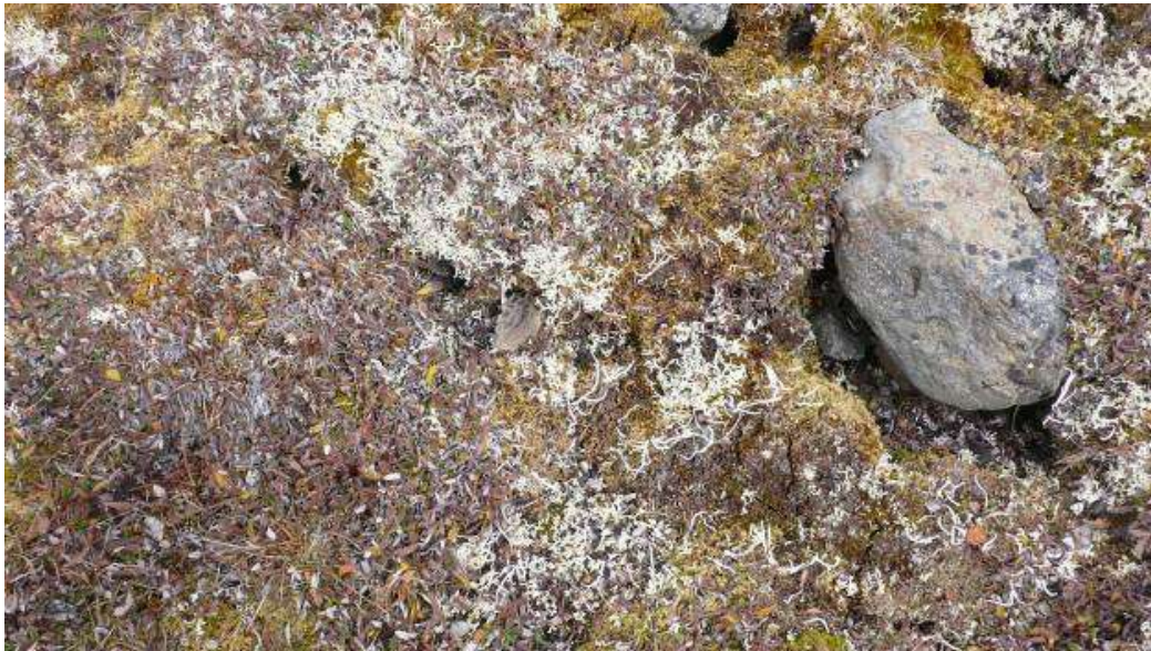
Figure 6. Habitat at the capture site (site 4) of an Ogilvie Mountains collared lemming (site 12 – top; site 4 – bottom).

The documentation of Ogilvie Mountains Collared Lemmings on other mountains within the Ogilvie Mountains suggests that the species may be somewhat common and widespread in suitable habitats within the local area.