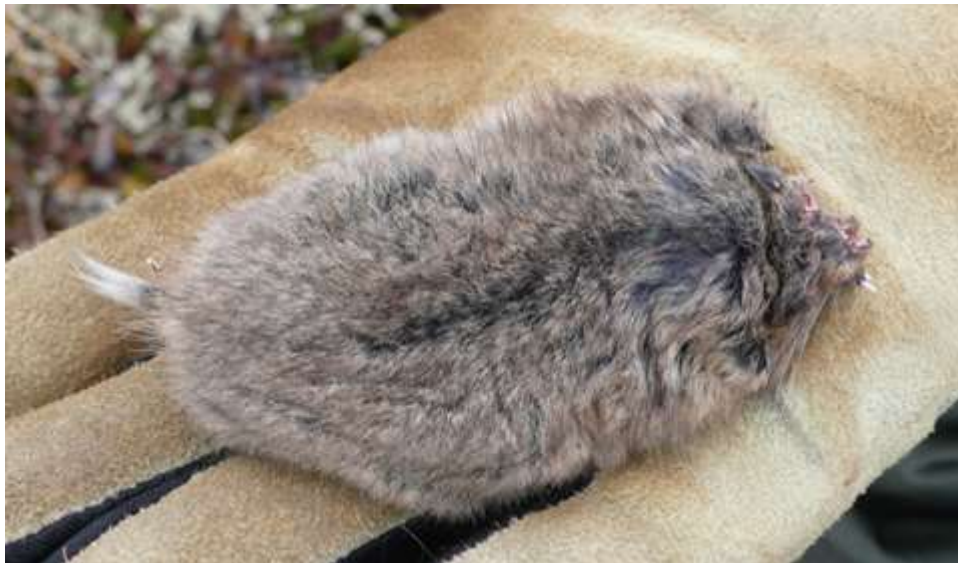
Figure 1. Ogilvie Mountain collared lemming ( Dicrostonyx nunatakensis ) collected from the Seela Range, Tombstone Territorial Park.

The Ogilvie Mountains collared lemming is distinguished from other species of collared lemmings by its grey-brown pelage colour and small skull size (Nagorsen 1998, Figure 1). Geographically, the Ogilvie Mountains collared lemming is separated from populations of Northern collared lemmings ( Dicrostonyx groenlandicus ) in northern Yukon and adjacent Alaska and Northwest Territories by more than 400 km of apparently unoccupied habitat (Nagorsen 1998). Youngman (1967) speculated that the Ogilvie Mountains collared lemming represents a relict population of collared lemmings that became isolated on nunataks (unglaciated mountain tops) more than 10,000 years ago and remains reproductively isolated.