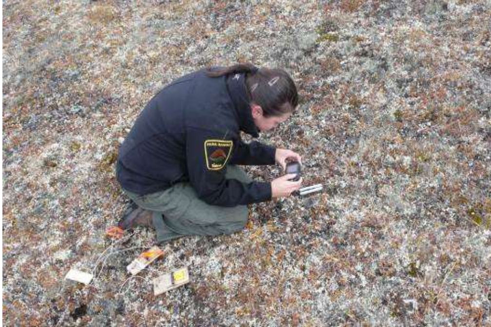
Figure 5. Alice McCulley photo documenting an Ogilvie Mountain collared lemming.