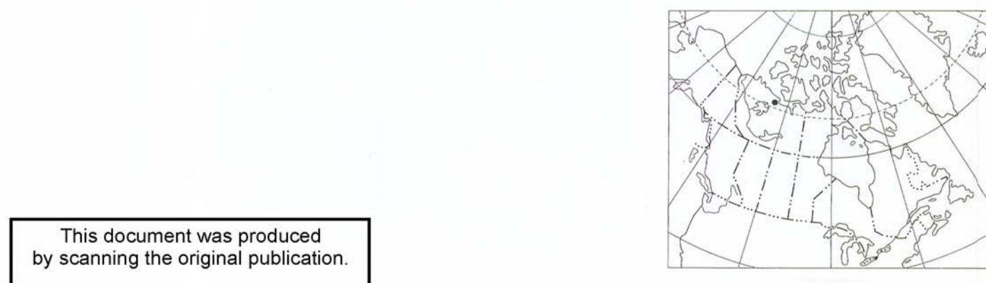
Figure 1 Locations of many of the known copper occurrences, faults, fault lineaments and some dyke lineaments in the Coppermine River area, District of Mackenzie.

Geology by E.D. Kindle, 1968 and 1969 Air photographs interpretations by E. D. Kindle, 1971 To accompany GSC Bulletin 214, by E.D. Kindle Geological cartography by the Geological Survey of Canada Base-maps published at the same scale by the Surveys and Mapping Branch in 1964 and 1965 Magnetic declination 1975 varies from 41°10' westerly at centre of west edge to 10° westerly at centre of east edge. Mean annual change -10.1' References: Baragar, W.R.A. and Davidson, J.A. 1970. Coppermine and Dismal Lakes Map-areas. Geological Survey of Canada Paper 70-1, Part A, p. 120 Baragar, W.R.A. 1969. The Geochemistry of Coppermine River Basalts. Geological Survey of Canada Paper 69-44