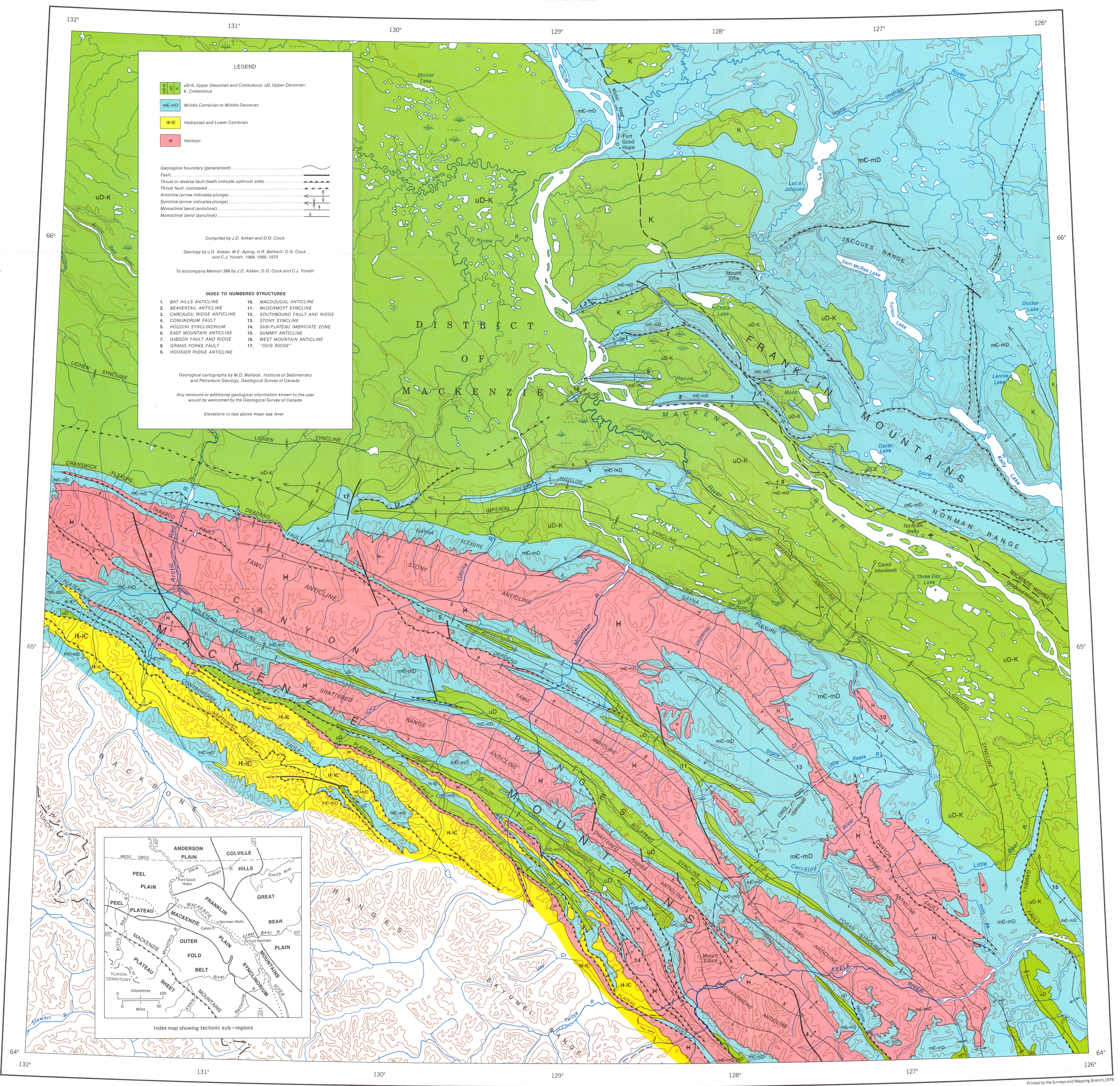
Figure 24. Generalized geological map of parts of Mackenzie Mountains, northern Franklin Mountains, Mackenzie and Peel Plains and Peel Plateau