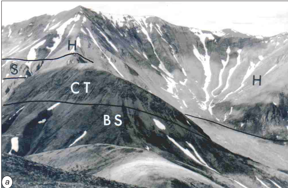
a. Southward view of a section through the upper part of the Black Slate (BS), Cherty Tuff (CT), Starr (S), and Hoole (H) formations. In this recessive sequence the Cherty Tuff is most resistant. Each unit is folded disharmonically between its contacts, but at map scale each retains integrity. From near St. Cyr Fault, about five km west of the boundary between Quiet Lake and Finlayson Lake map areas. This black-and-white photo does not show the colour contrast in weathering appearance of the units: From the base up they are: black, orange, brown and buff.