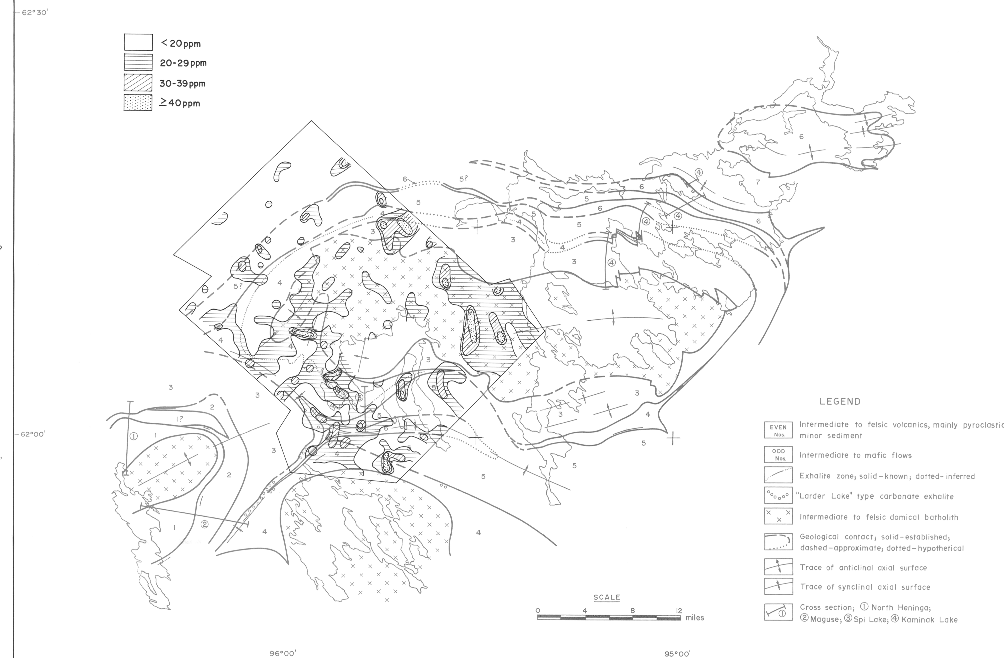
Figure 20. Distribution of copper in rock fragments (s.g.>2.85)