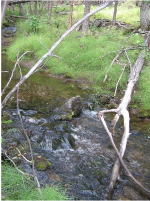
W11 – Nancy Lee Creek (Tributary of Williams Creek), looking upstream (August 2006)