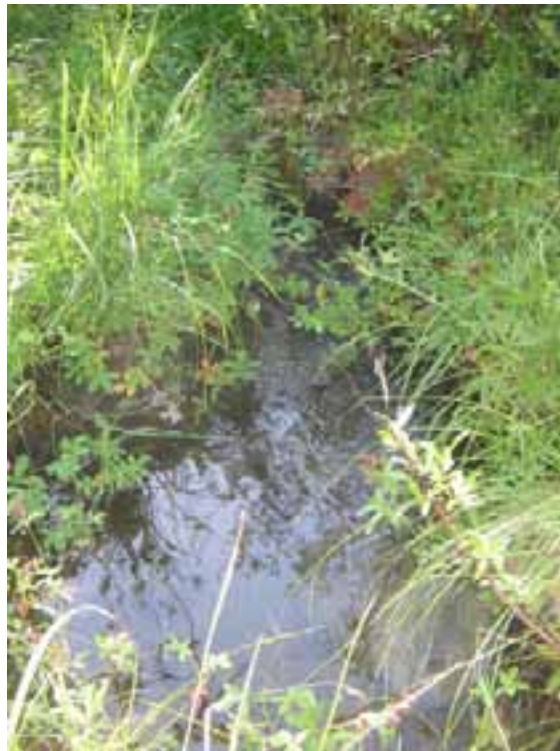
W9 – Williams Creek Upstream of Access Road, looking downstream (August 2006)