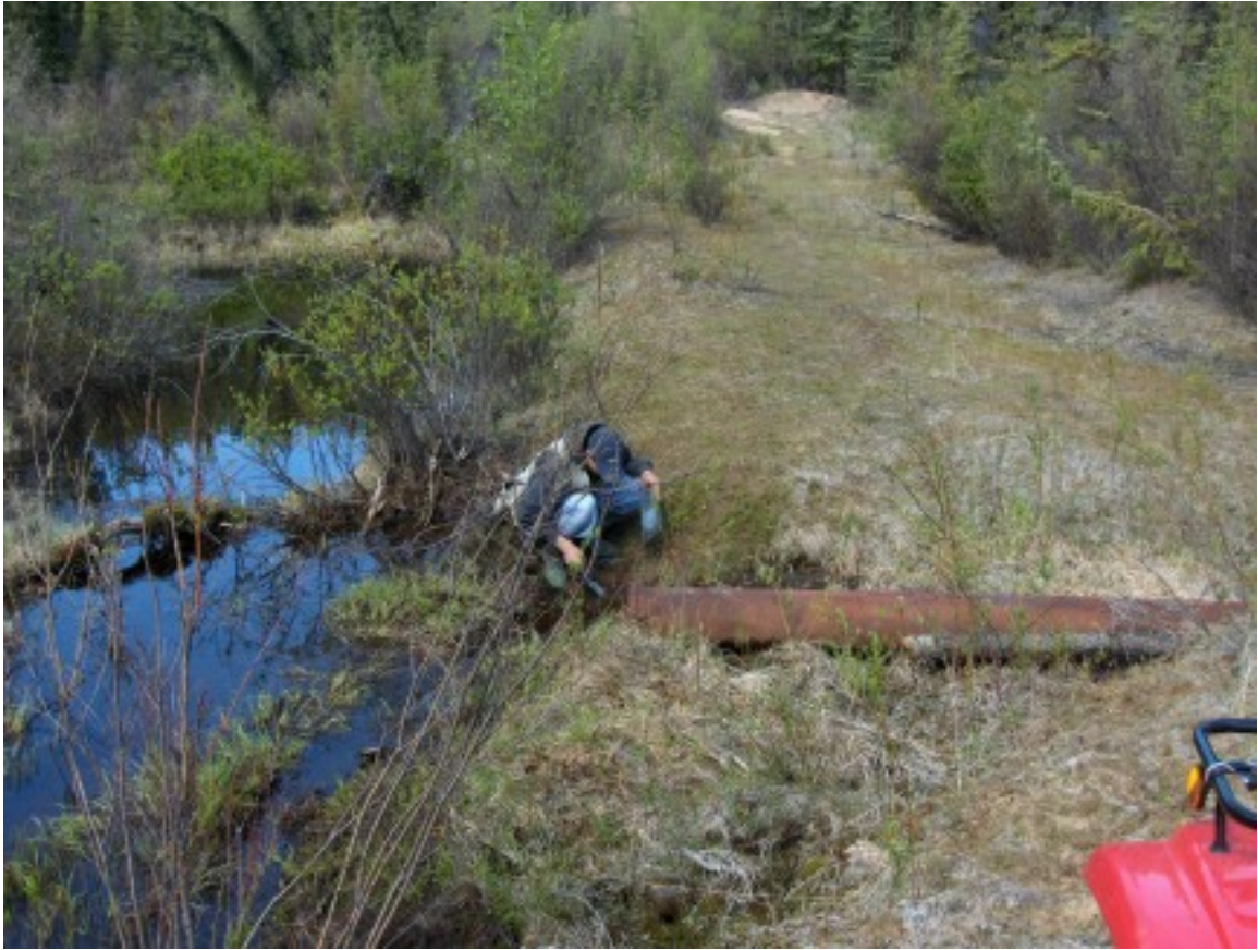
W7 – North Williams Creek Culvert at Haul Road, upstream (June 2006)