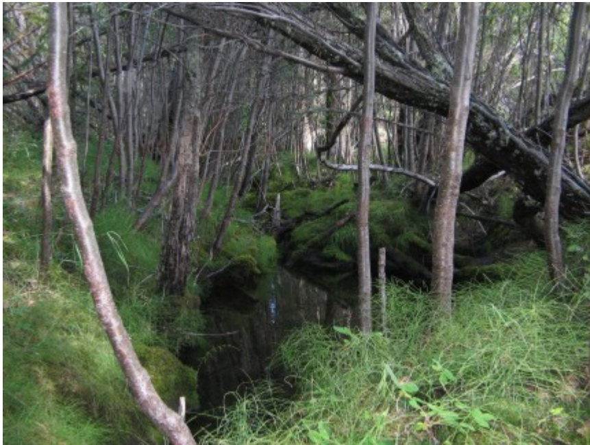
W4 – Williams Creek Downstream of Confluence with North Williams Creek, looking downstream (August 2006)