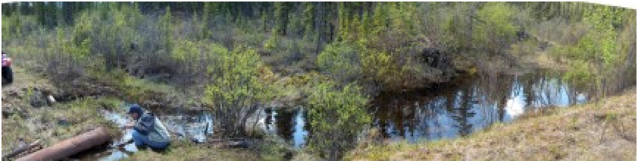
W7 – North Williams Creek Culvert at Haul Road, upstream (June 2006)