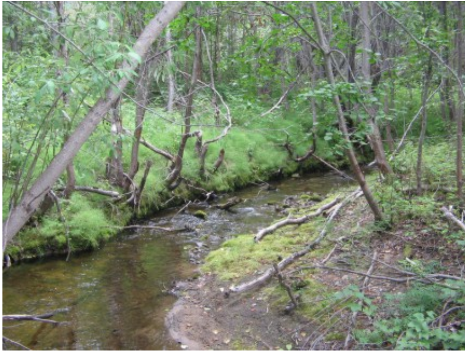
W10 – Williams Creek Upstream of Yukon River, looking upstream (August 2006)