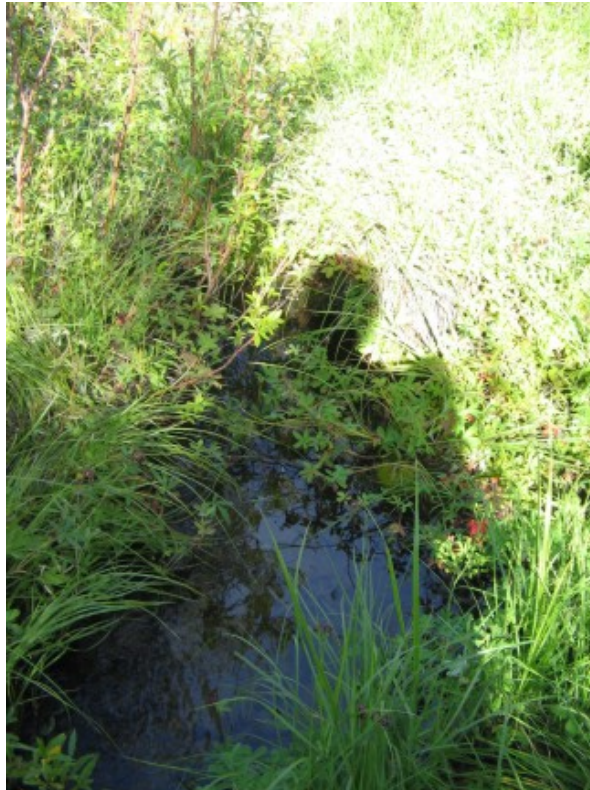
W9 – Williams Creek Upstream of Access Road, looking upstream (August 2006)