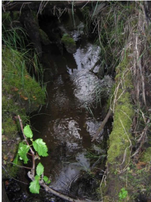
W6 – Williams Creek Downstream of South East Tributary, looking downstream (August 2006)