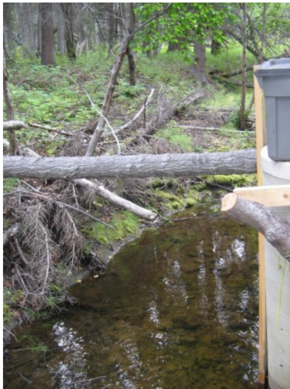
W10 – Williams Creek Upstream of Yukon River, looking downstream (August 2006)