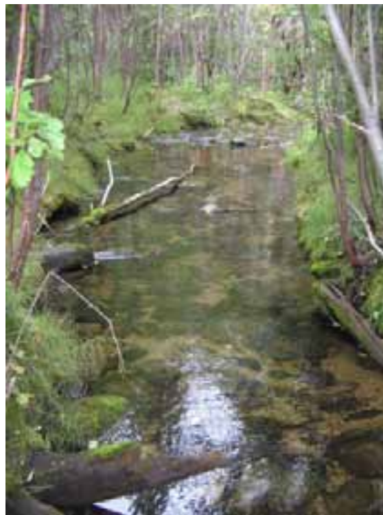
W13 – Williams Creek Upstream of Confluence with Nancy Lee Creek, looking downstream (August 2006)