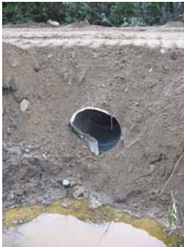
W7- New North Williams Creek Culvert at Haul Road (August 2006)