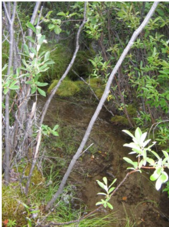
W5 – South East Tributary to Williams Creek, looking downstream (August 2006)