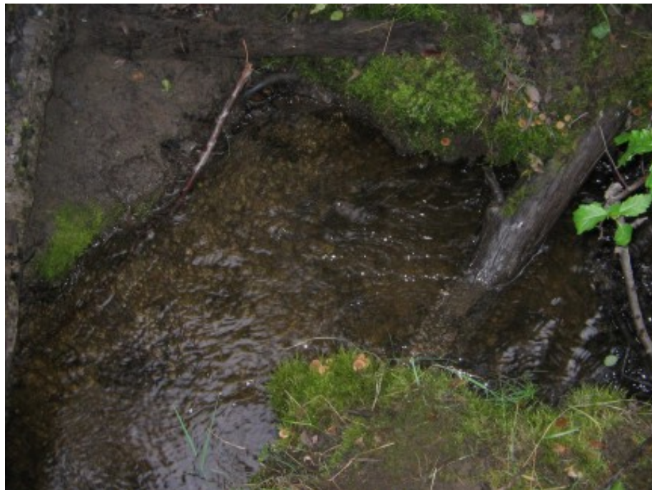
W6-Williams Creek Downstream of South East Tributary, looking upstream (August 2006)