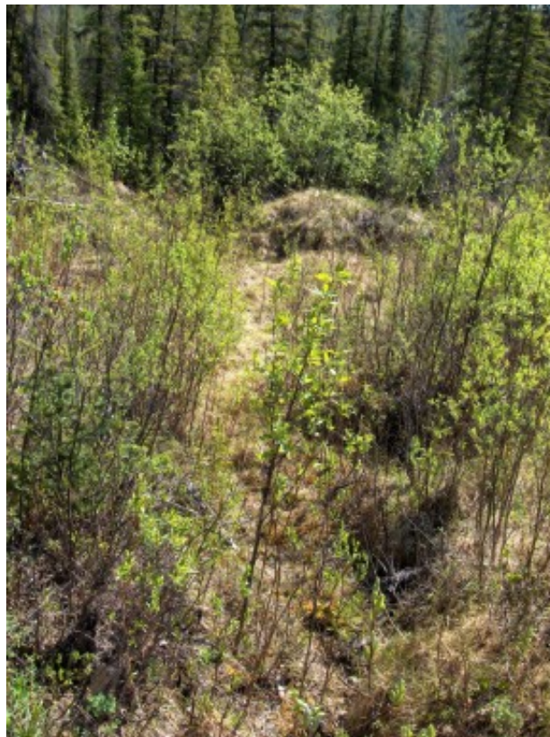
W1 – Tributary to Williams Creek, looking downstream (June 2006)