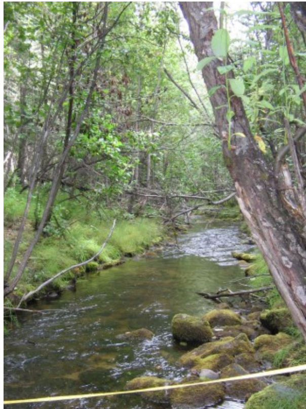
W12 – Williams Creek Downstream of Confluence with Nancy Lee Creek, looking downstream (August 2006)