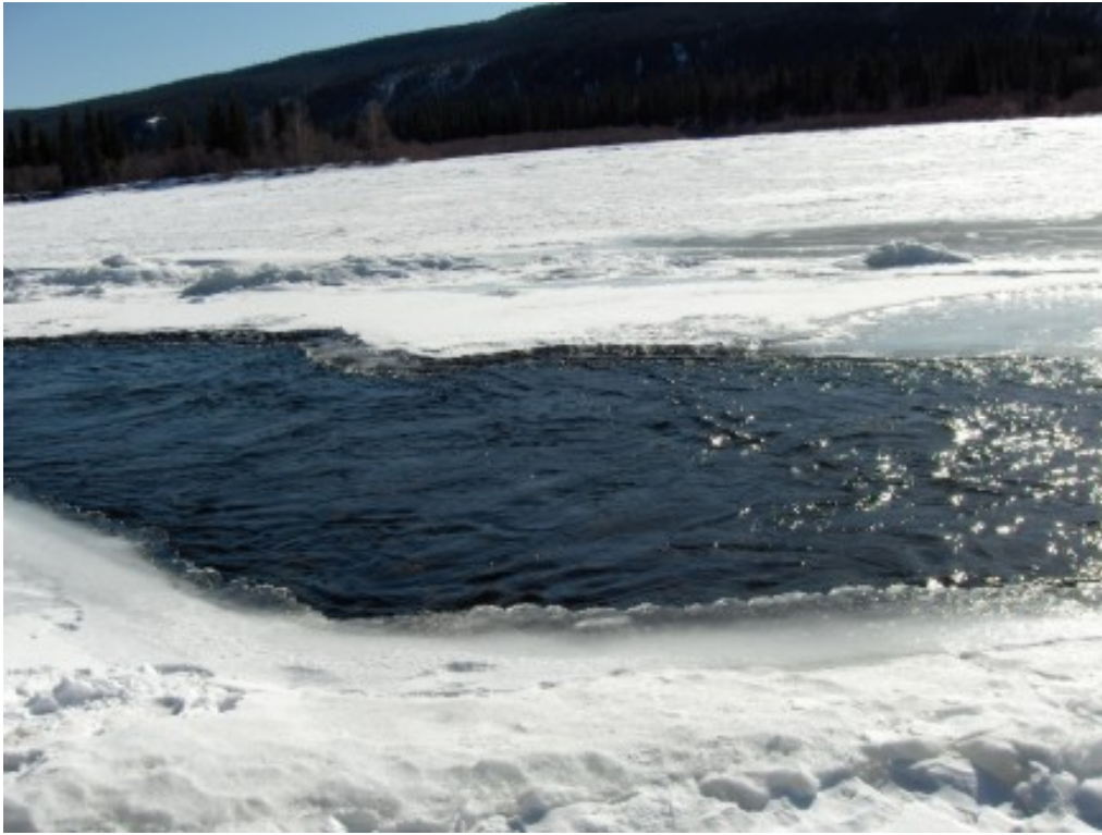
Y1 – Upstream of Williams Creek Confluence (April 2006)