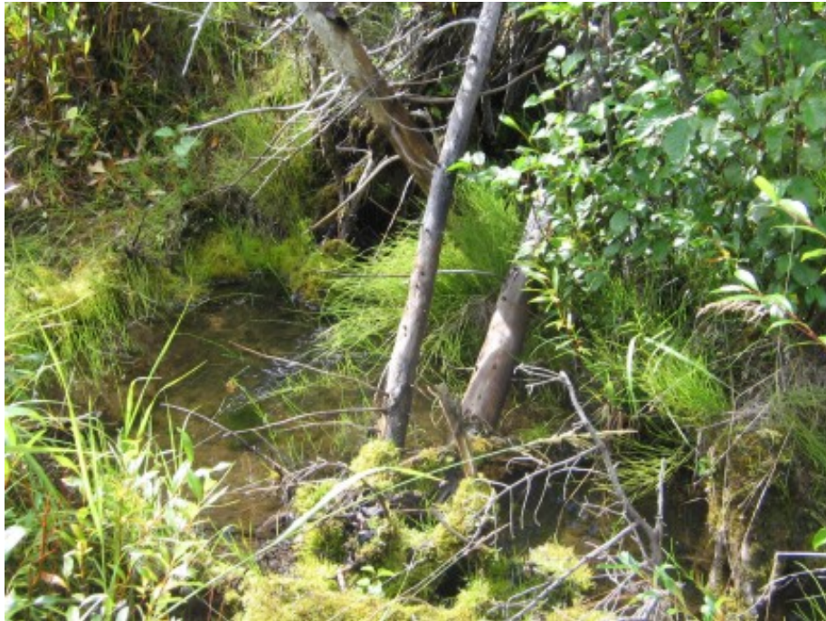
W3 – North Williams Creek, looking upstream (August 2006)