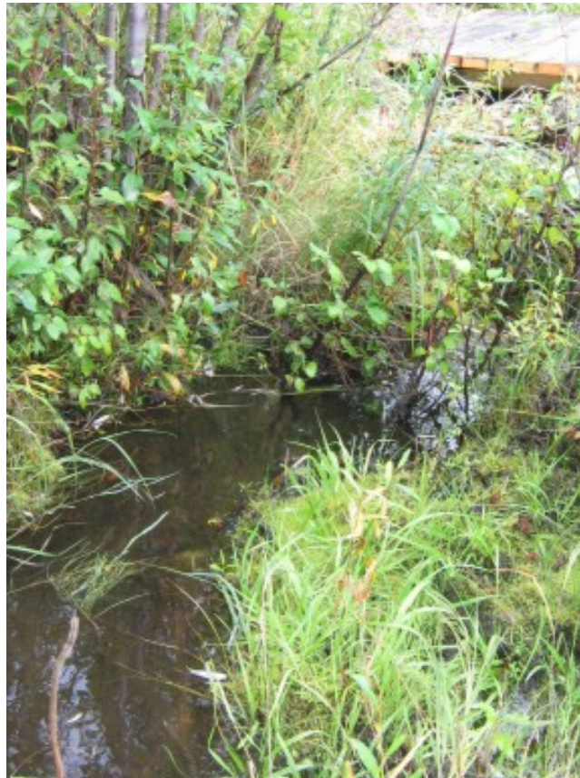
W3 – North Williams Creek, looking downstream (August 2006)