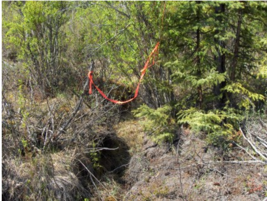
W1 – Tributary to Williams Creek, looking upstream (June 2006)