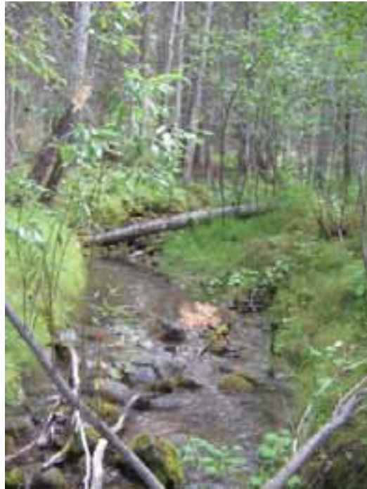
W13 – Williams Creek Upstream of Confluence with Nancy Lee Creek, looking upstream (August 2006)