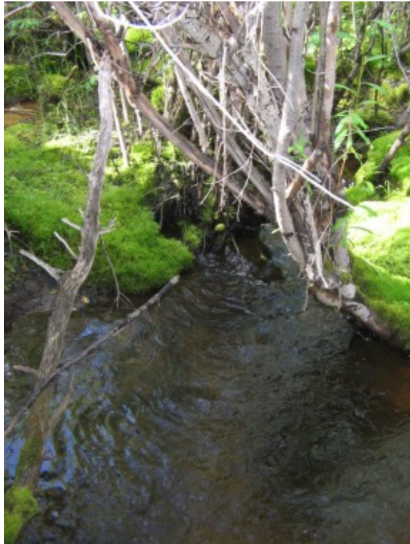
W2 – Williams Creek Downstream of W1 Tributary, looking downstream (August 2006)