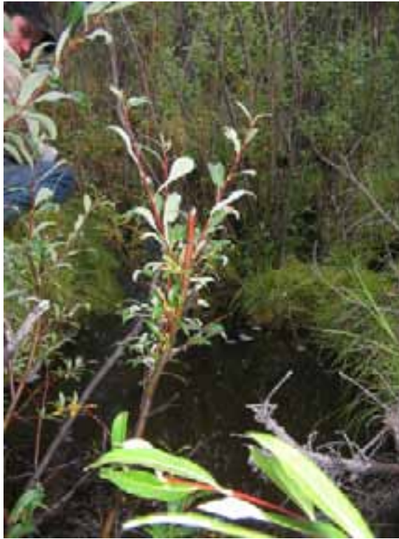
W5 – South East Tributary to Williams Creek, looking upstream (August 2006)