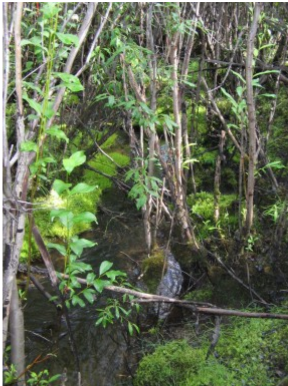
W2 – Williams Creek Downstream of W1 Tributary, looking upstream (August 2006)