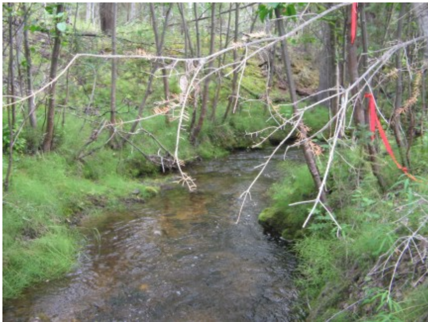
W11 – Nancy Lee Creek (Tributary of Williams Creek), looking downstream (August 2006)