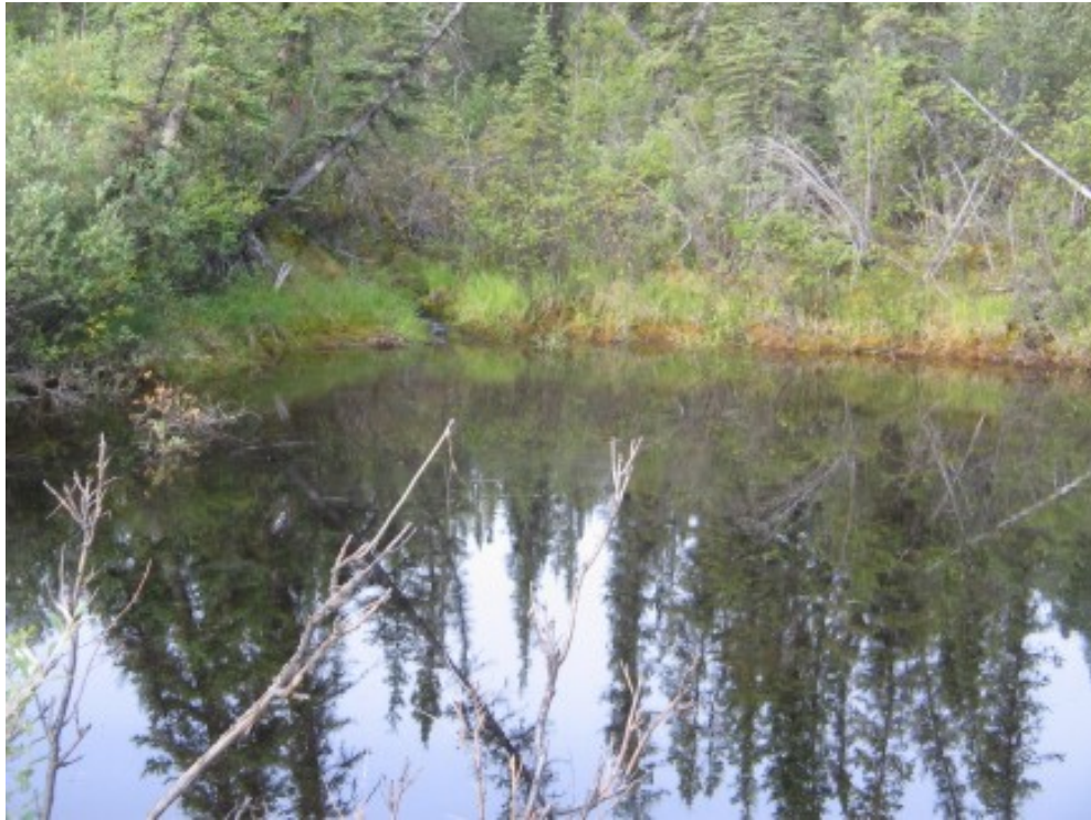
Pond Upstream of W7 – North Williams Creek Culvert at Haul Road (August 2006)