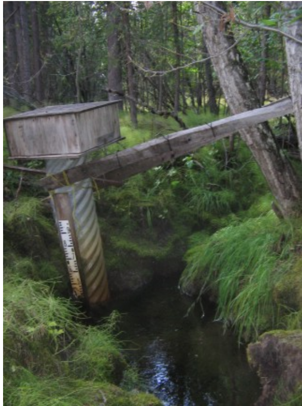
W4 – Williams Creek Downstream of Confluence with North Williams Creek, looking upstream (August 2006)