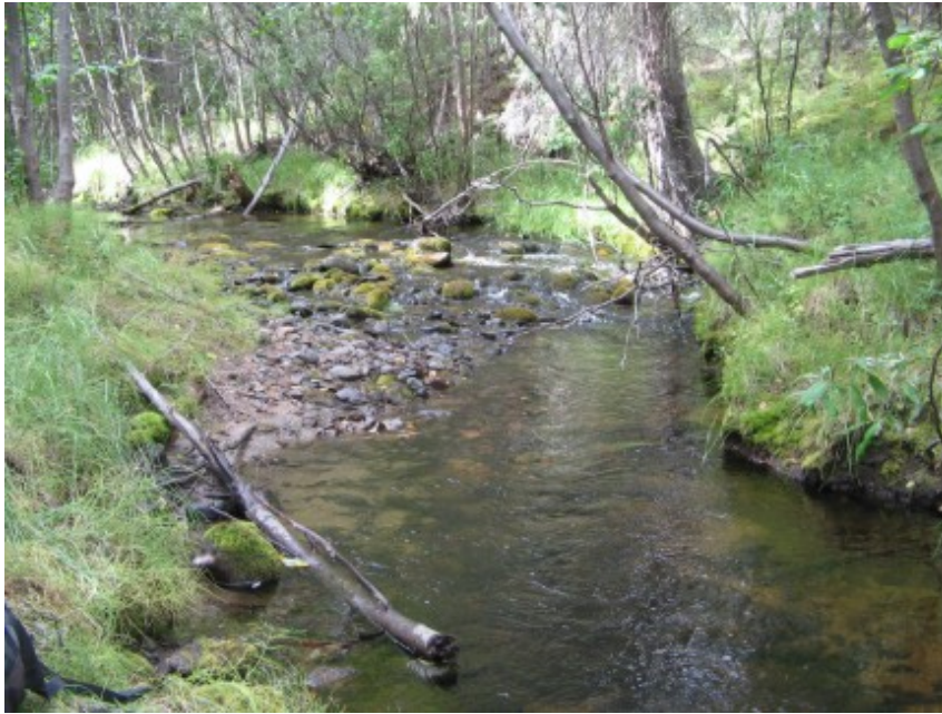
W12 – Williams Creek Downstream of Confluence with Nancy Lee Creek, looking upstream (August 2006)