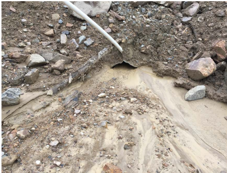
Figure 56: Secondary Stockpile drainage ditch culvert blocked (outlet)