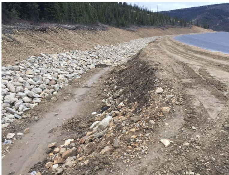
Figure 25: Material deposited in HLF Phase 1B Interceptor Ditch