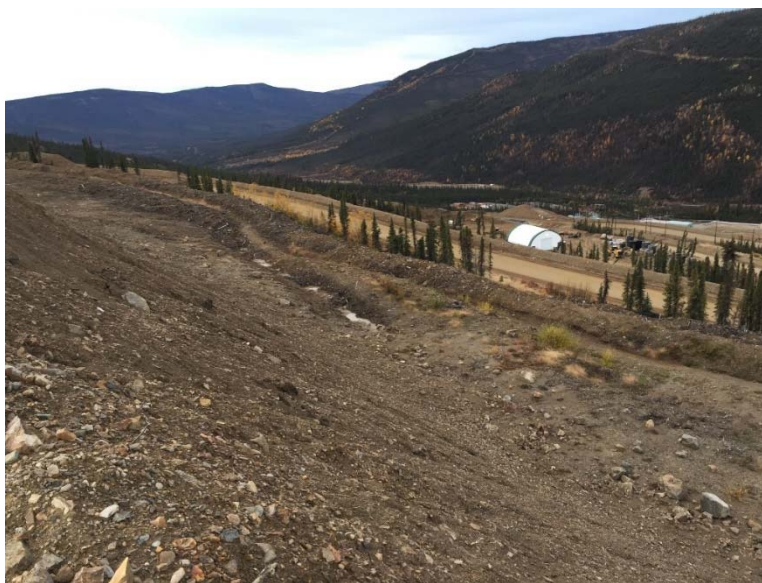
Figure 16: Unconnected Ditch Section