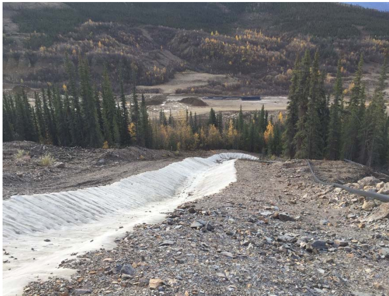
Figure 52: Events Pond Emergency spillway