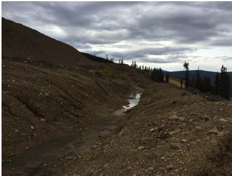
Figure 15: Pooling water in perimeter ditch