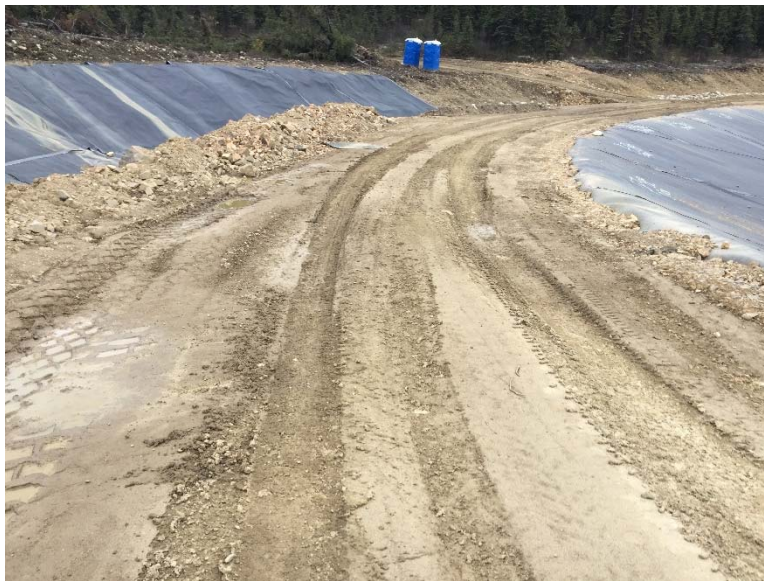
Figure 21: Soft road sections above Phase 1B of the HLF