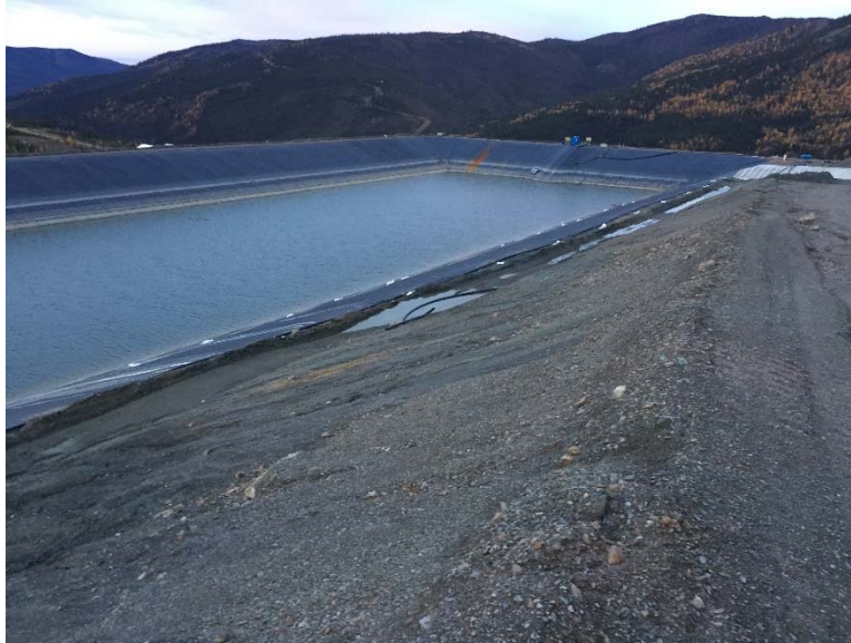
Figure 46: Pooling water above Event Pond