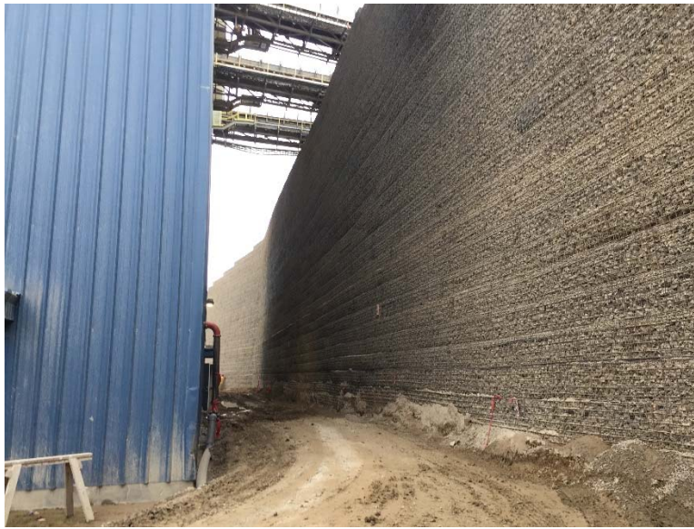
Figure 36: MSE wall behind secondary/tertiary crusher