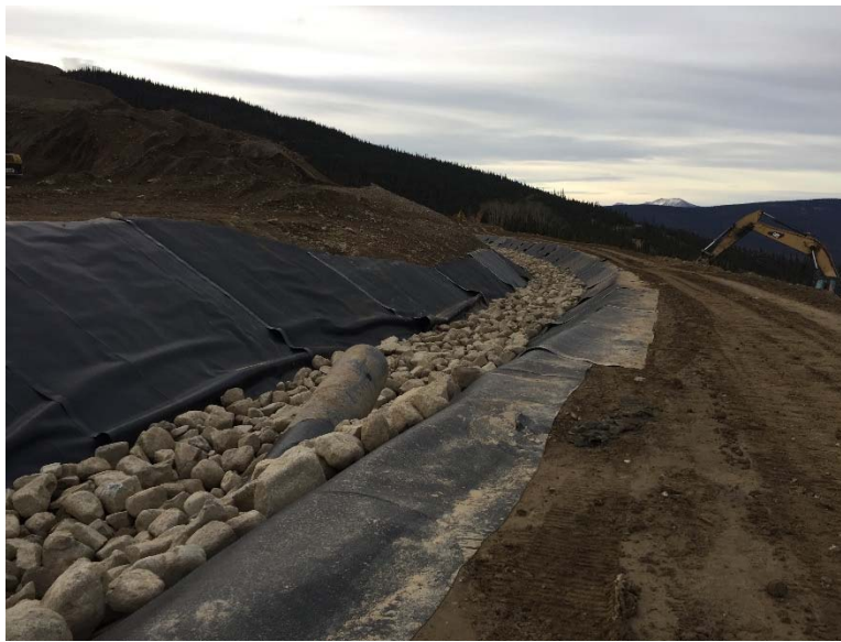
Figure 55: Ditch A under construction (2020)