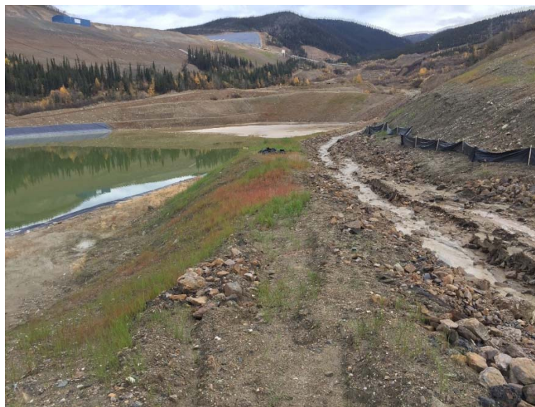
Figure 7: LDSP – Erosion on the Southwest slope 2020