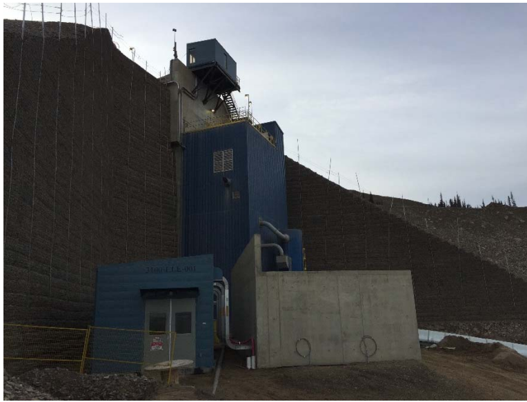
Figure 32: Southeast Face