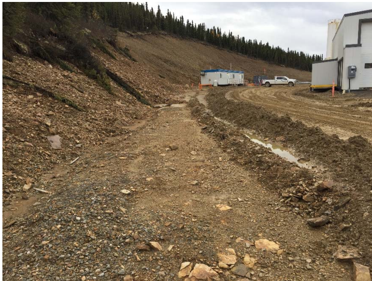
Figure 67: Orica perimeter ditch