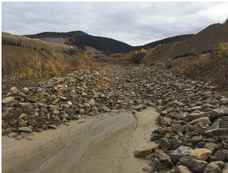
Figure 59: Silt fencing constructed in areas of erosion on cut slopes