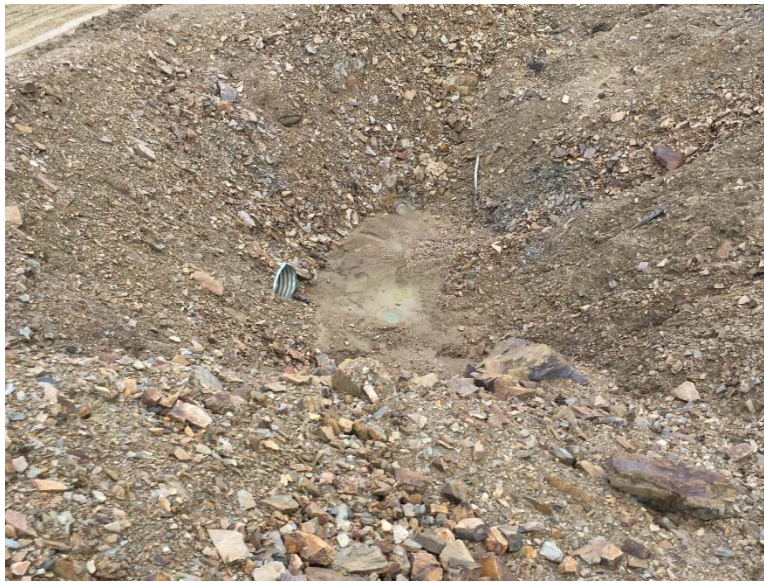
Figure 68: Orica sump