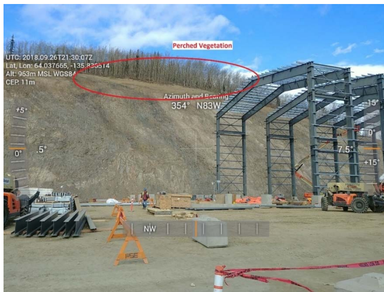
Figure 40: Slopes behind ADR (2018)