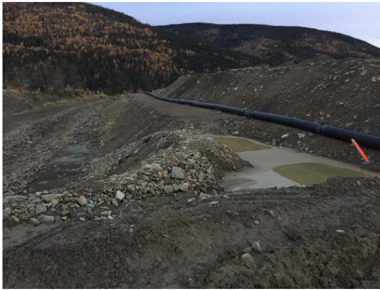
Figure 62: Pooled water above Ditch C