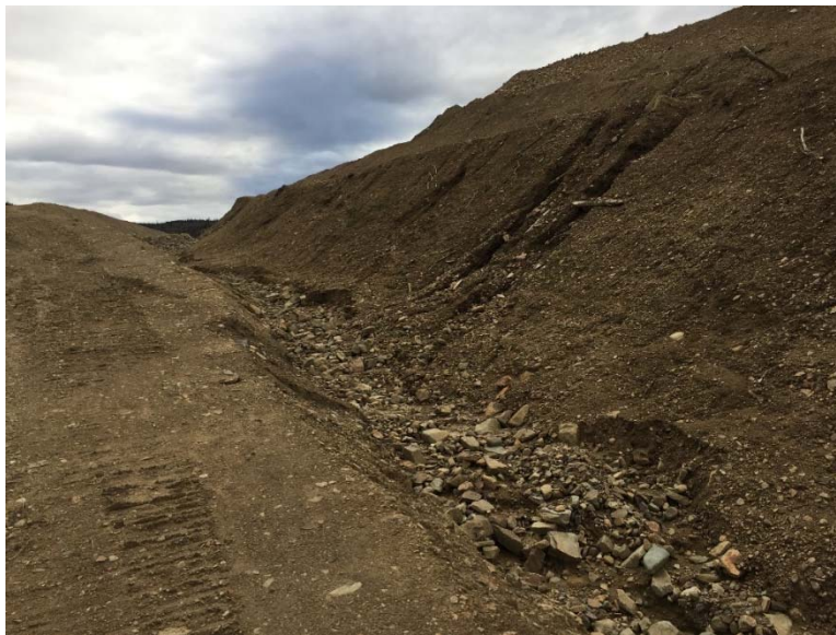
Figure 13: Perimeter Ditching