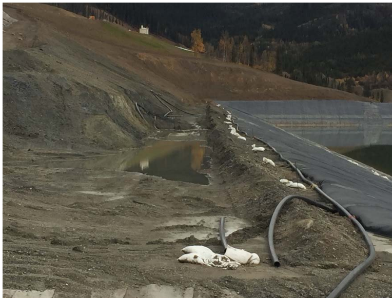
Figure 47: Pooling water above Event Pond