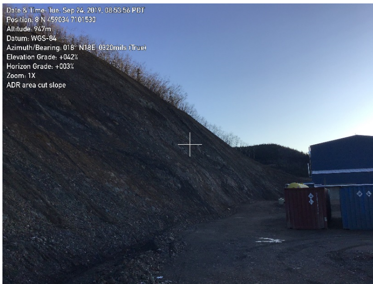
Figure 39: Slopes behind ADR (2019)