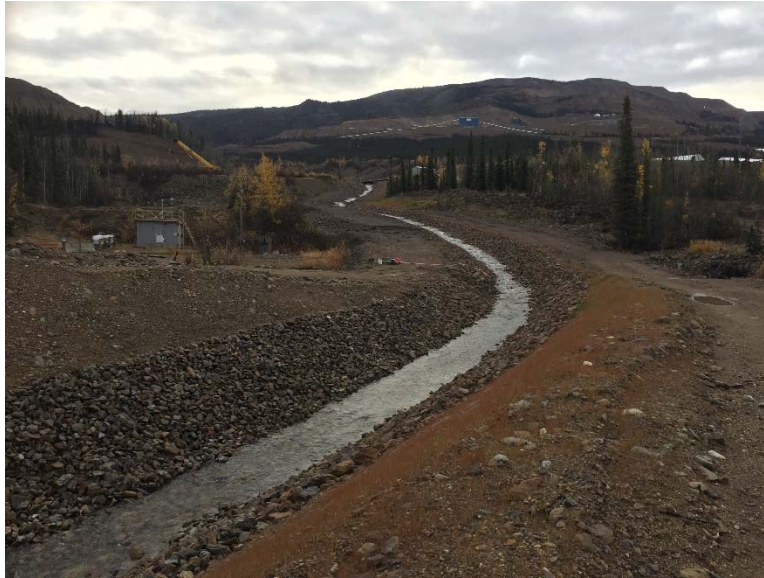
Figure 60: Ditch C typical section