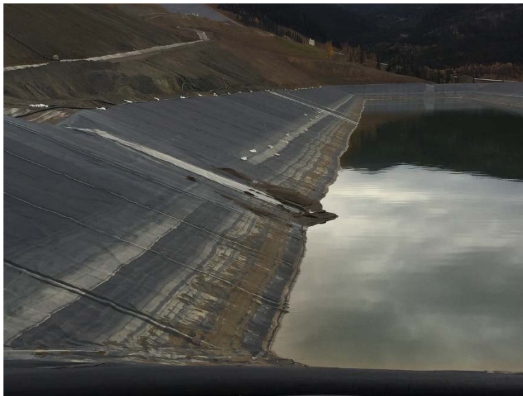
Figure 49: Silt build-up at HLF Spillway discharge