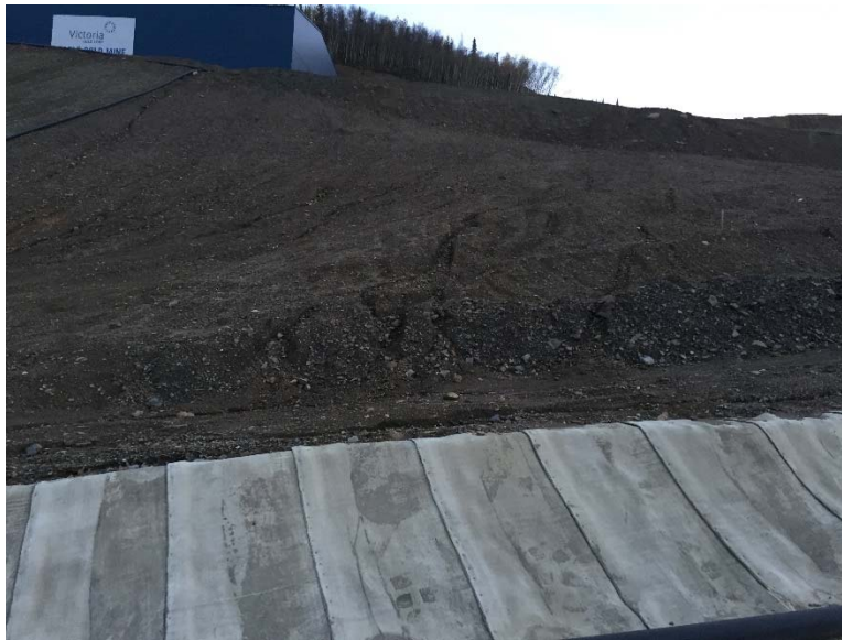
Figure 44: Rill erosion above HLF spillway