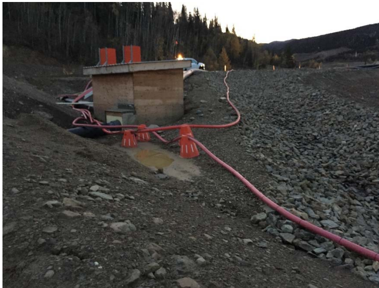
Figure 1: LDSP – Pooling adjacent to Shed and Diversion Ditch

Some minor pooling of water was noticed at the shed which houses the junction of pipes and is adjacent to the rip-rapped groundwater diversion ditch (Figure 1), no other items noted. Site noted that there was above average rainfall throughout the summer and leading up to the site visit which may have lead to this and other instances of pooling water on site. There is an outlet sump and weir which were constructed between the 2018 and 2019 inspections; no issues noted (Figure 2).