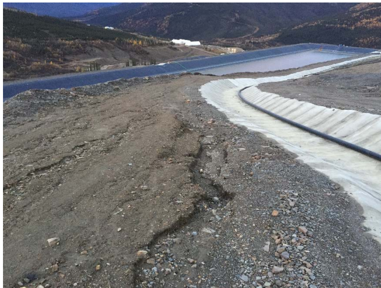
Figure 43: Rill erosion below HLF spillway