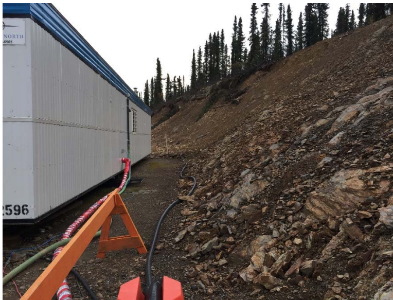
Figure 66: Section of corrected slope (2020)