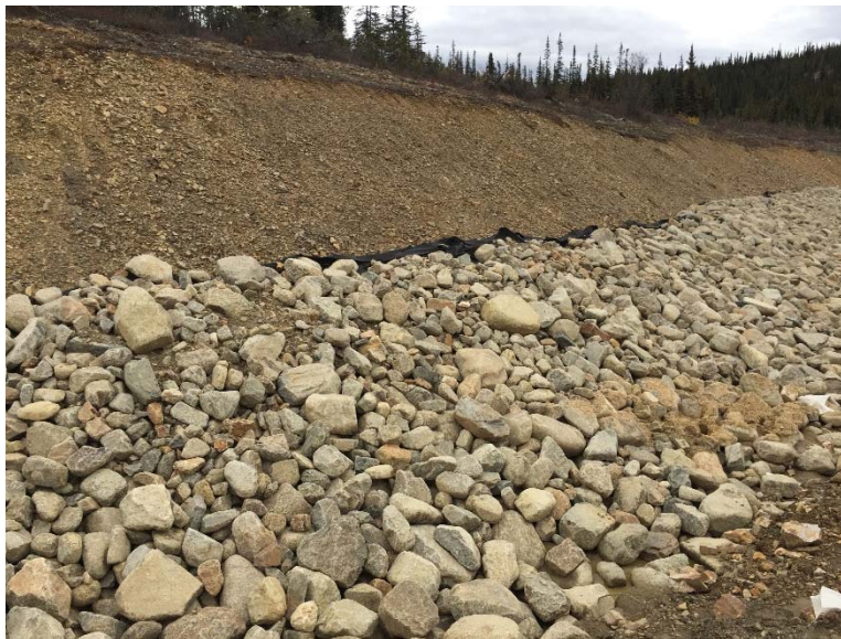
Figure 23: Typical Phase 1B Ditch