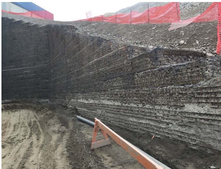
Figure 35: South side of MSE wall