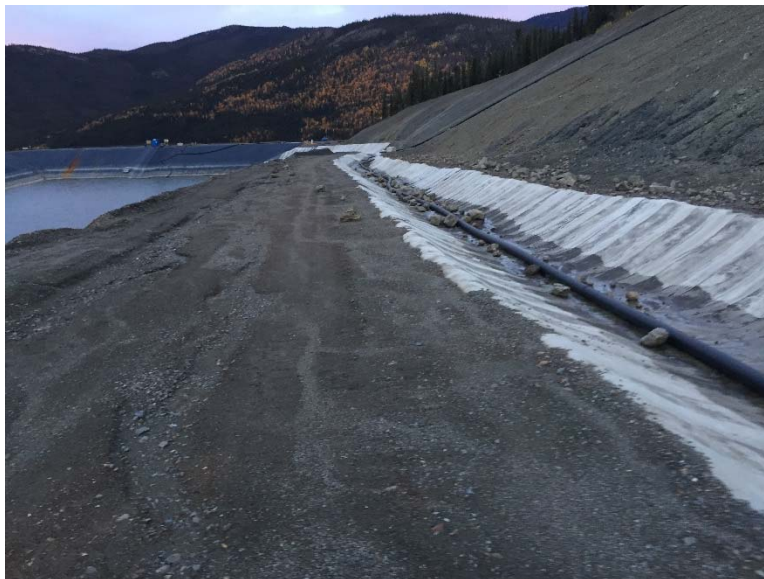
Figure 51: Slopes from heap leach spillway