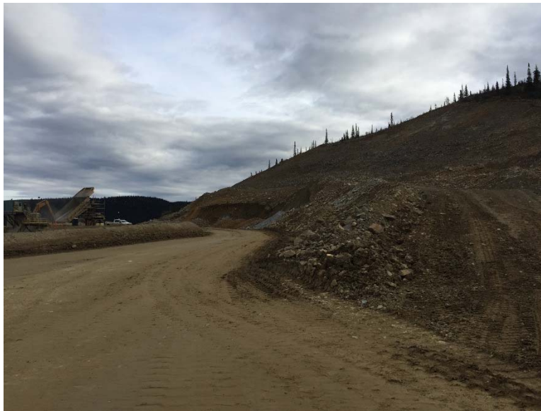
Figure 34: Cut slopes above Primary Crusher