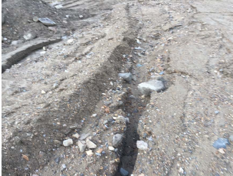
Figure 70: Small gully forming adjacent to stockpiles