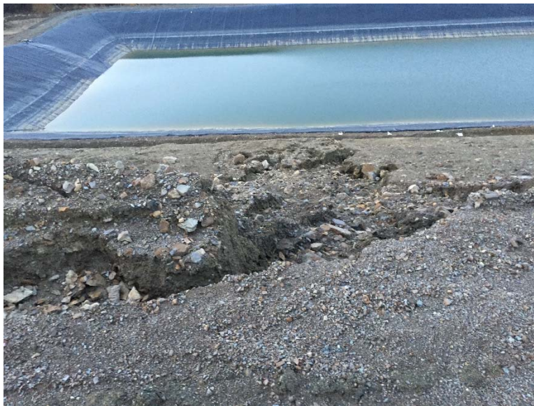
Figure 45: Scoured channel above Event Pond