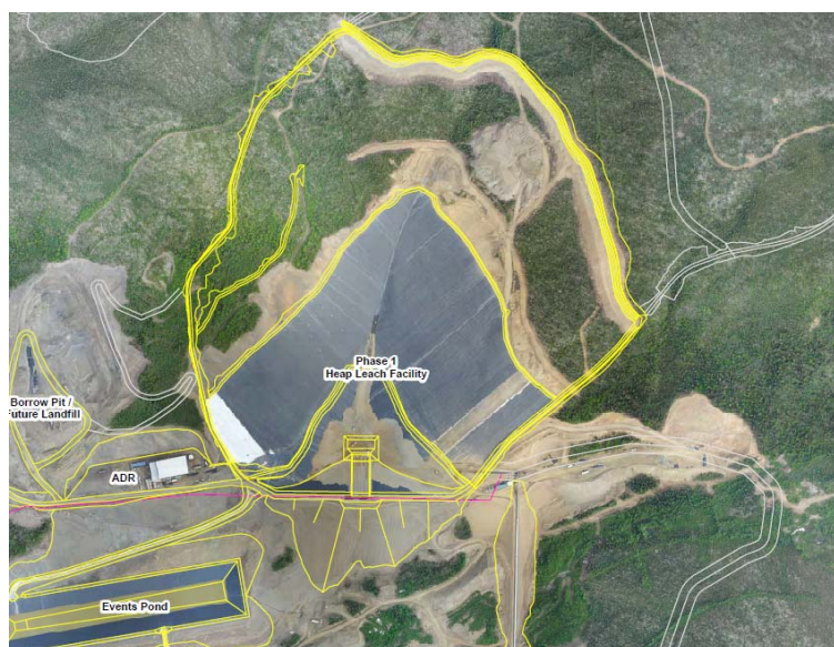
Figure 17: Heap Leach Facility Overview 2019

The Heap Leach Facility (HLF) is currently operational. In 2019 the Phase 1A expansion had been constructed as shown in Figure 17. By the time of the 2020 inspection the Phase 1B expansion was largely complete with placement of overliner drain fill and PLS collection piping ongoing as shown in Figure 18.