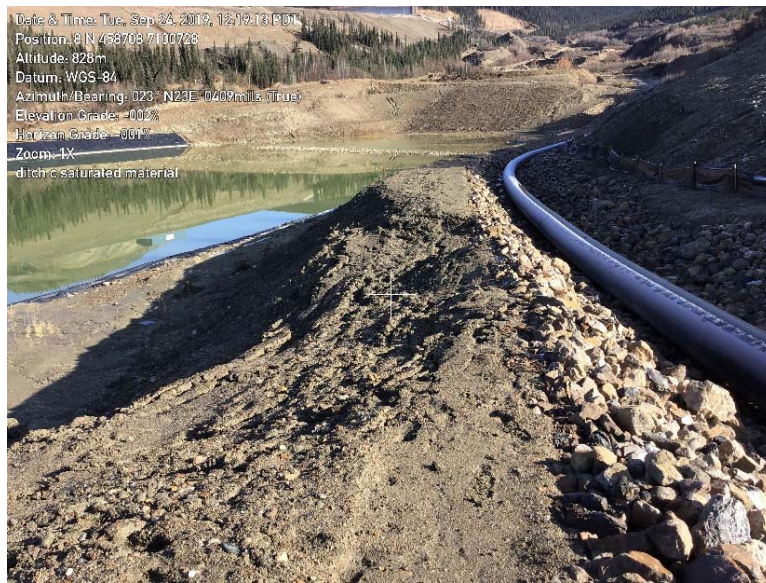
Figure 6: LDSP – Erosion on the Southwest slope 2019