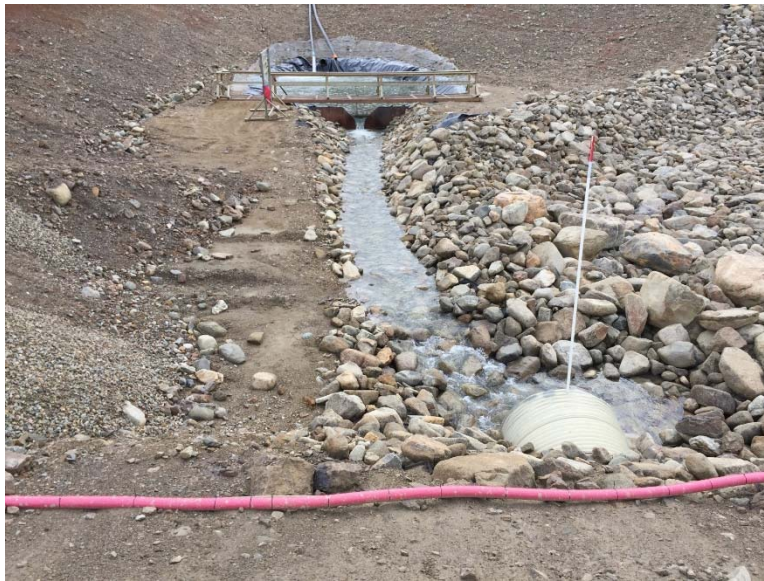
Figure 2: LDSP – Outlet Sump and Weir