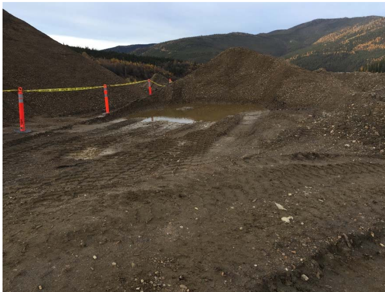
Figure 71: Poned area adjacent to stockpiles