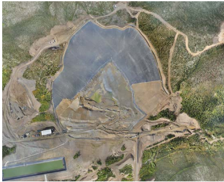
Figure 18: Heap Leach Facility Overview 2020