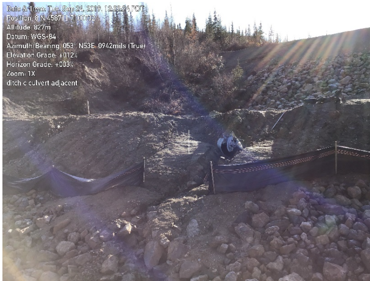
Figure 8: LDPS – Some flow from adjacent culvert 2019