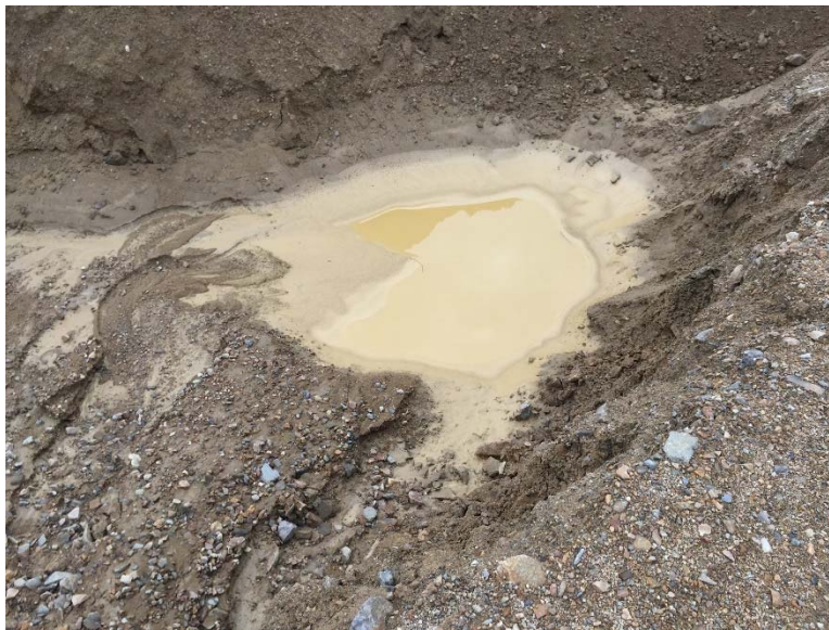
Figure 57: Secondary Stockpile drainage ditch culvert blocked (inlet)