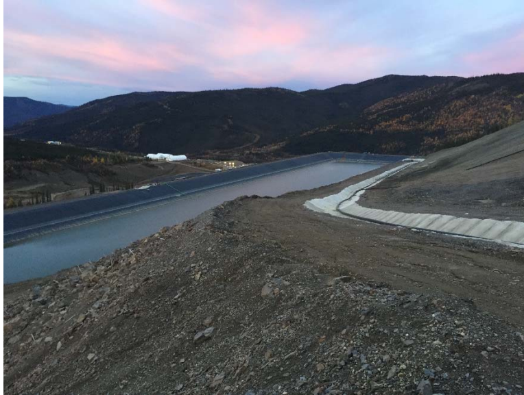
Figure 42: Overall view of event pond