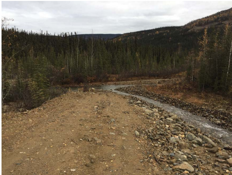
Figure 61: Ditch C Outfall to Haggart Creek