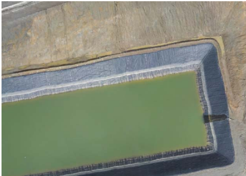
Figure 48: Pooling water above Event Pond