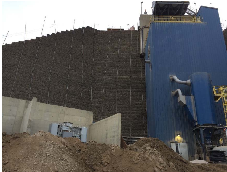
Figure 30: Primary Crusher