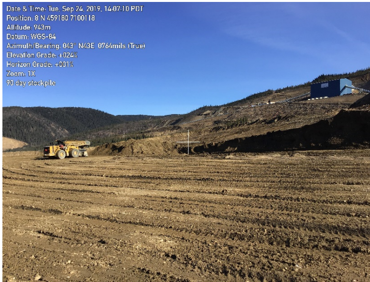
Figure 10: Secondary Stockpile under construction 2019