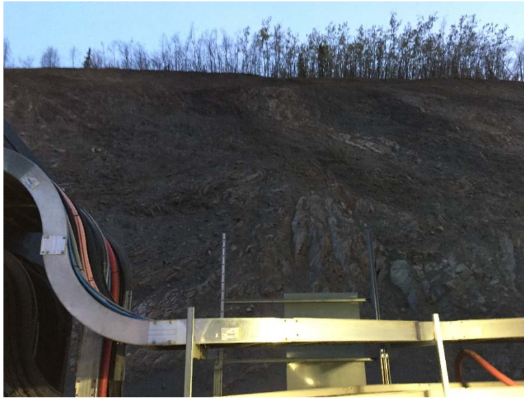
Figure 38: Slopes behind ADR (2020) with unraveling and rilling