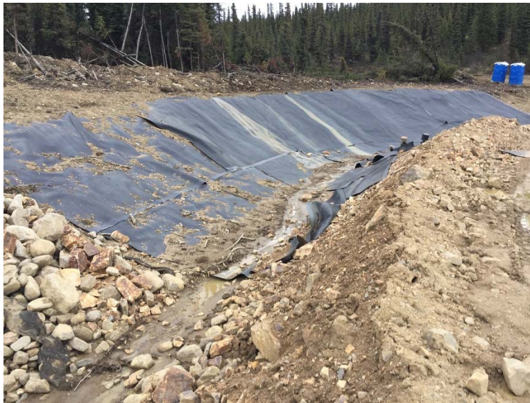
Figure 26: Unfinished section of Interceptor Ditch