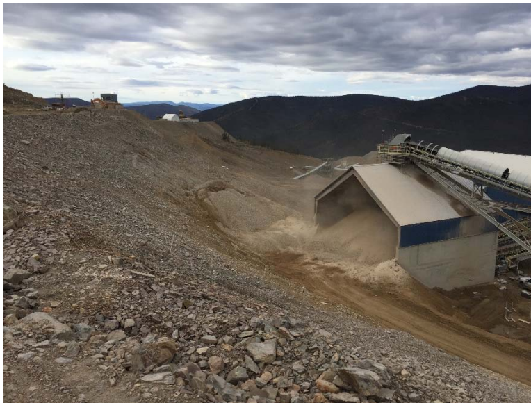
Figure 37: Cut slopes above Secondary/Tertiary Crusher