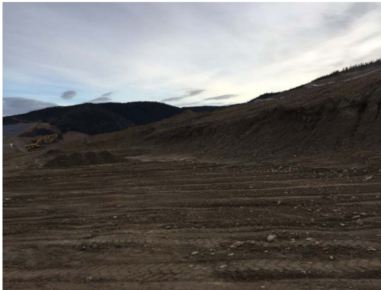
Figure 12: Secondary Stockpile Cut Slopes 2020