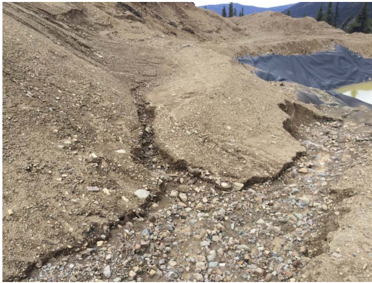
Figure 14: Perimeter Ditching