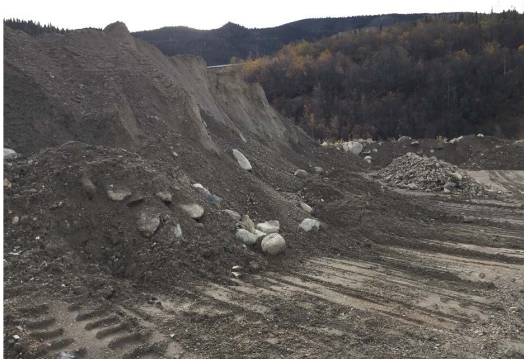
Figure 69: Some stockpiles with steep side slopes