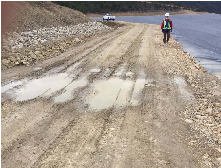
Figure 20: Pooling water above Phase 1B of the HLF