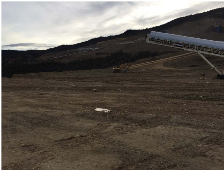
Figure 11: Secondary Stockpile completed 2020