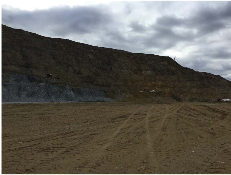
Figure 28: Pit Walls