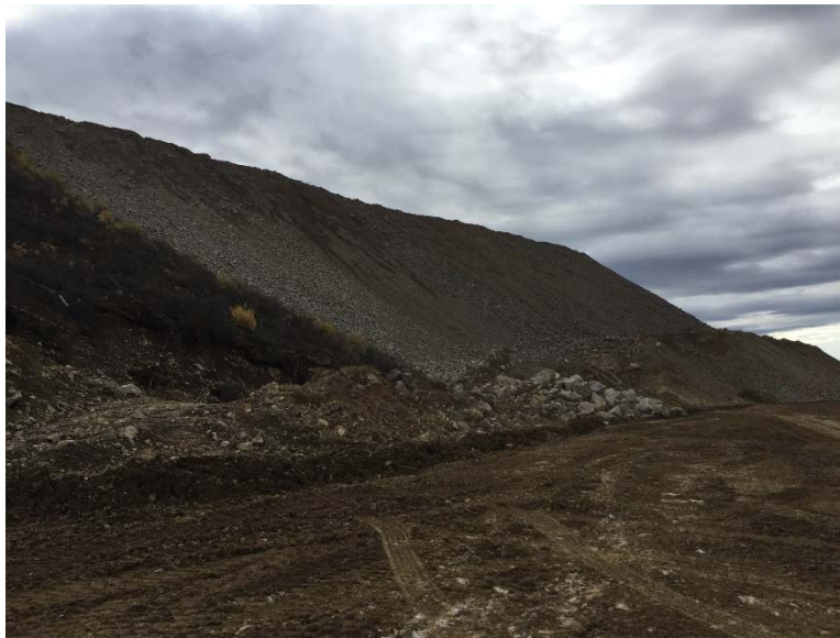
Figure 29: Dump Fill Slope