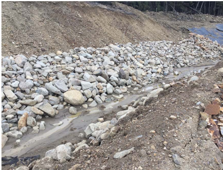
Figure 24: Material deposited in HLF Phase 1B Interceptor Ditch