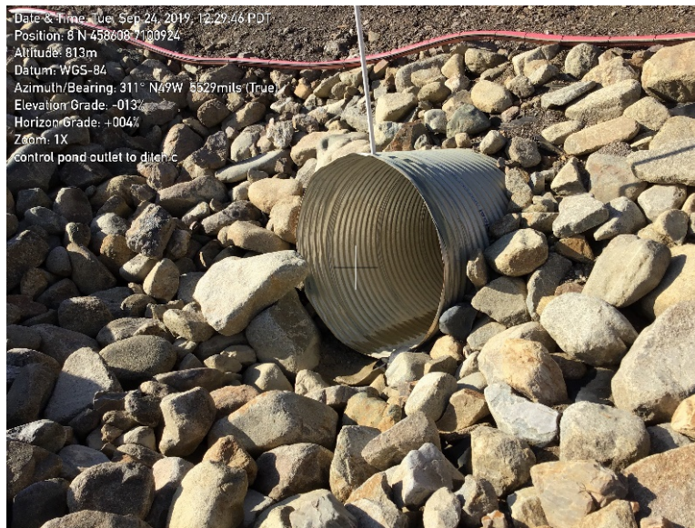
Figure 4: LDSP - 1500mm Culvert 2019 Inspection