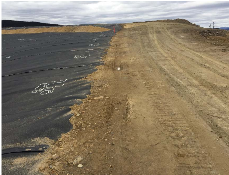
Figure 22: Soft road sections above Phase 1B of the HLF