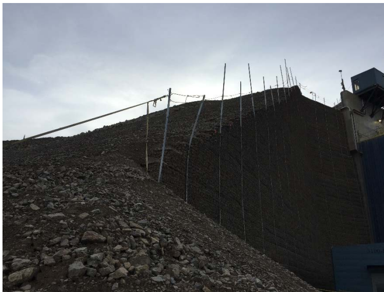
Figure 33: Northwest fill slopes