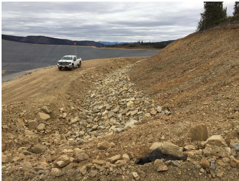
Figure 27: Phase 1B Interception Ditch sloping