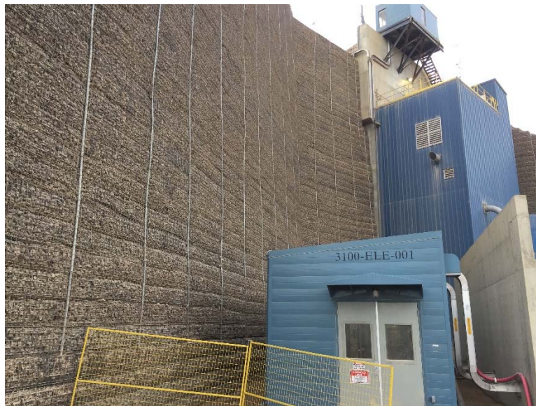
Figure 31: Northwest Face