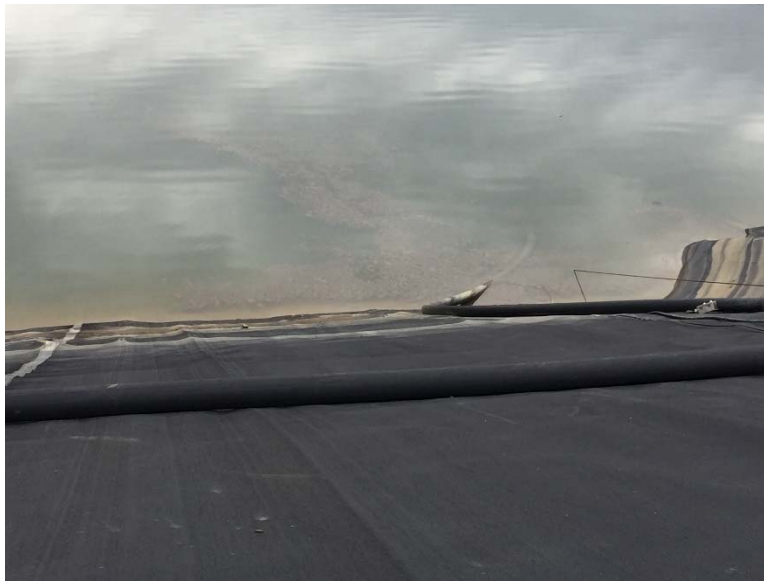
Figure 50: Material build-up on Event Pond bottom