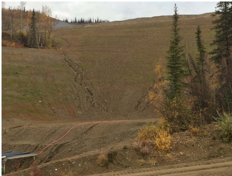
Figure 19: Scouring and rilling along toe slope of HLF