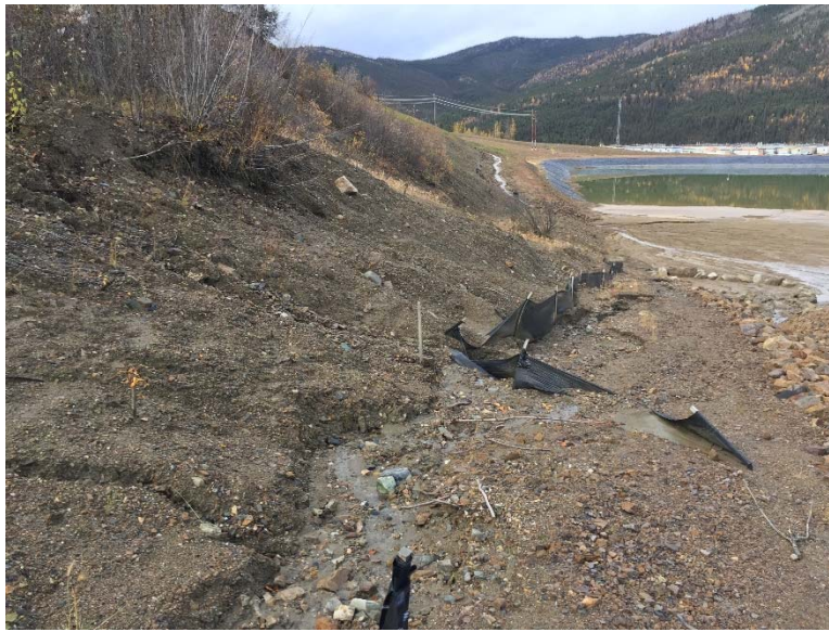
Figure 58: Erosion on South cut slope above Ditch B