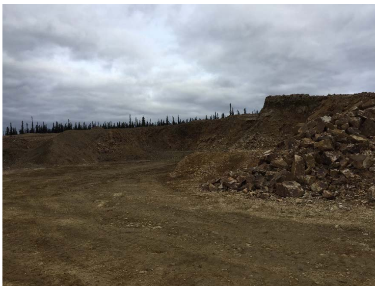
Figure 64: Over steepened slopes