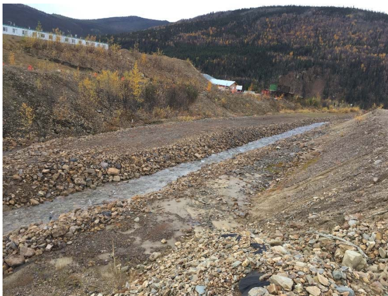
Figure 63: Pooled water ditch discharge into Ditch C