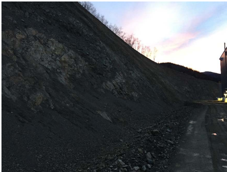
Figure 41: Typical North Toe Ditch cross section