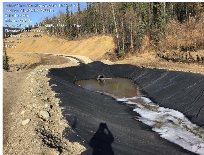
Figure 53: Flow into collection sump (2019)