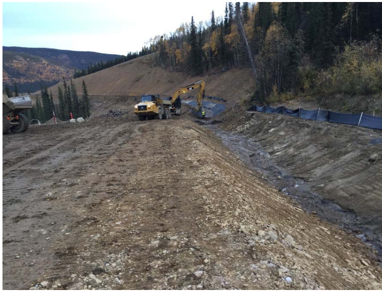
Figure 54: Ditch A under construction (2020)