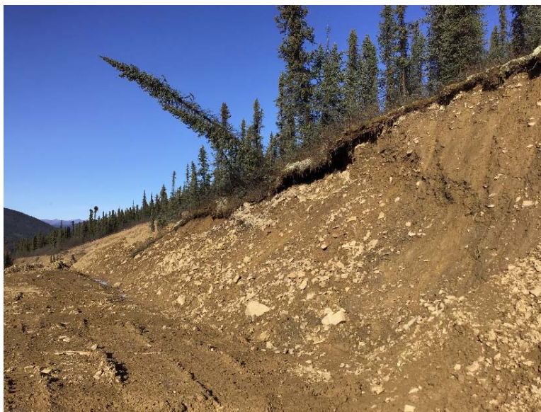
Figure 65: Section of over-steepened slope (2019)