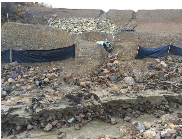
Figure 9: LDPS – Some flow from adjacent culvert 2020