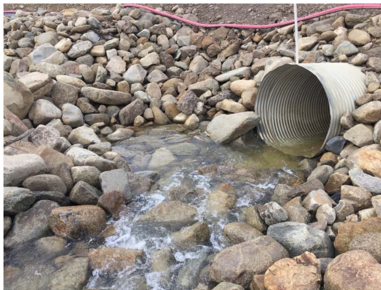
Figure 5: LDSP - 1500mm Culvert 2020 Inspection