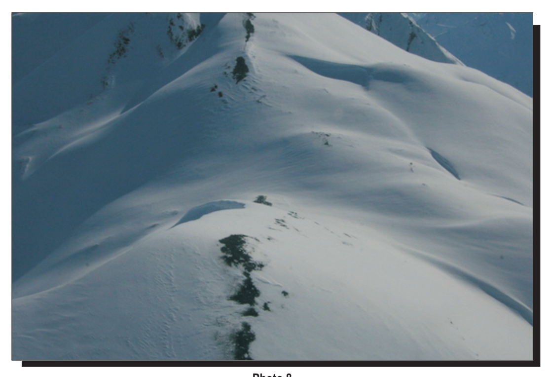
Photo 8 Typical habitat and snow cover characteristics in the area of the proposed access road. Photo taken April 13, 2009.