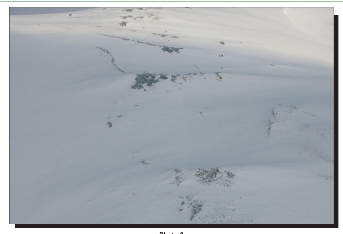
Photo 3 Typical habitat and snow cover characteristics on the South edge of Mount Allen above the proposed mine location. Photo taken April 7, 2009.