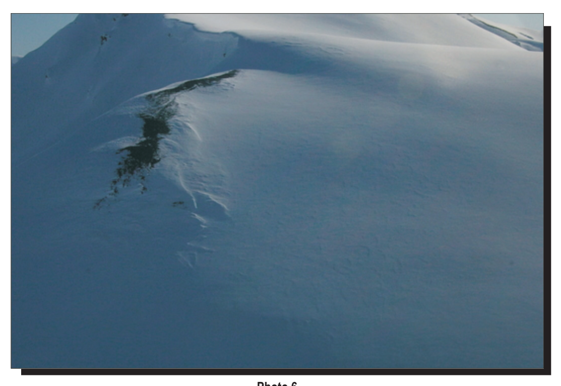
Photo 6 Typical habitat and snow cover characteristics in the sheep winter habitat WKA located East of the proposed access road in sample area 1b. Photo taken April 13, 2009.