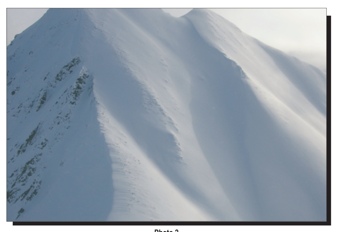
Photo 2 Typical habitat and snow cover characteristics in the sheep winter habitat WKA closest to the proposed mine location. Photo taken April 7, 2009.