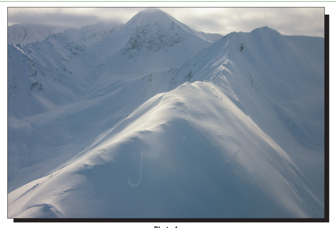
Photo 1 Typical habitat and snow cover characteristics in the sheep winter habitat WKA closest to the proposed mine location. Photo taken April 7, 2009.