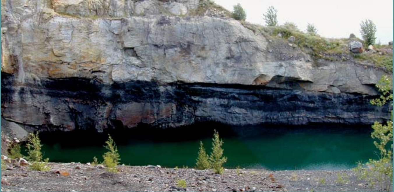
The Whiskey Lake open-pit coal mine in operation in the early 1990s (top) and later view of the upper coal seam (bottom).