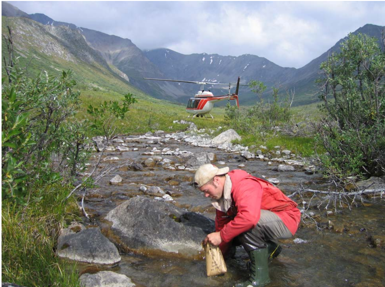
Figure 2. Pre-labelled Kraft paper bags and plastic bottles were used to collect samples of stream silts and stream waters. Flagging tape with a sample site number was used to mark sample sites. Field observations were noted on pre-printed water-resistant paper.

At each site a pre-labelled Kraft paper bag (12.5 cm x 28 cm with side gusset) (Fig. 2) was two-thirds filled with silt or fine sand collected from the active stream channel. In practice, the silt sample was collected after water samples were collected. Commonly, the sampler collected handfuls of silt from various points in the active stream channel while moving gradually upstream, normally over a distance of 5 to 15 m. If the stream channel consists mainly of clay, coarse material or organic sediment from which suitable sample material is scarce or absent, moss mat from the stream channel, which commonly contains trapped silt, may be added to the sample. A field duplicate pair of silt samples, assigned sequential sample numbers, is collected within each block of 20 samples. The first sample of the pair is assigned a replicate status value of 10 and the second is assigned a replicate status value of 20. Routine (non-duplicate) field samples are assigned replicate status values of 0.