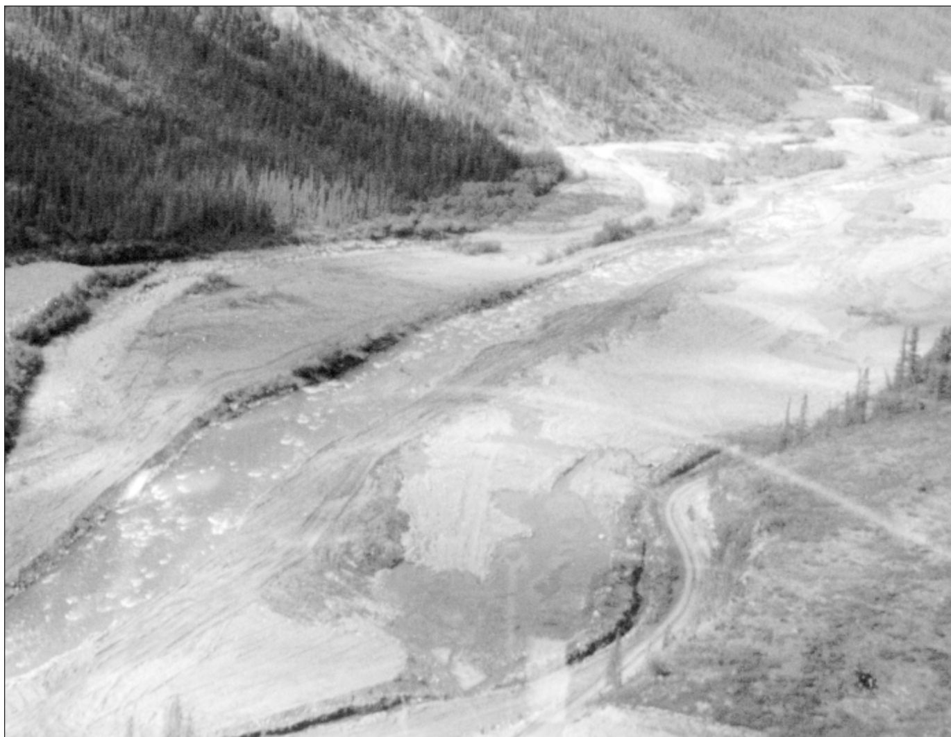
Tic Exploration Operation - Gladstone Creek