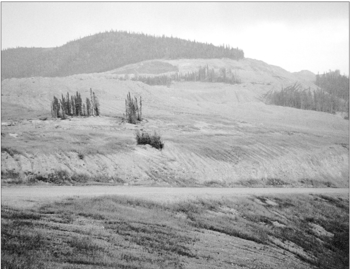
Brewery Creek Mine - Canadian pit reclamation